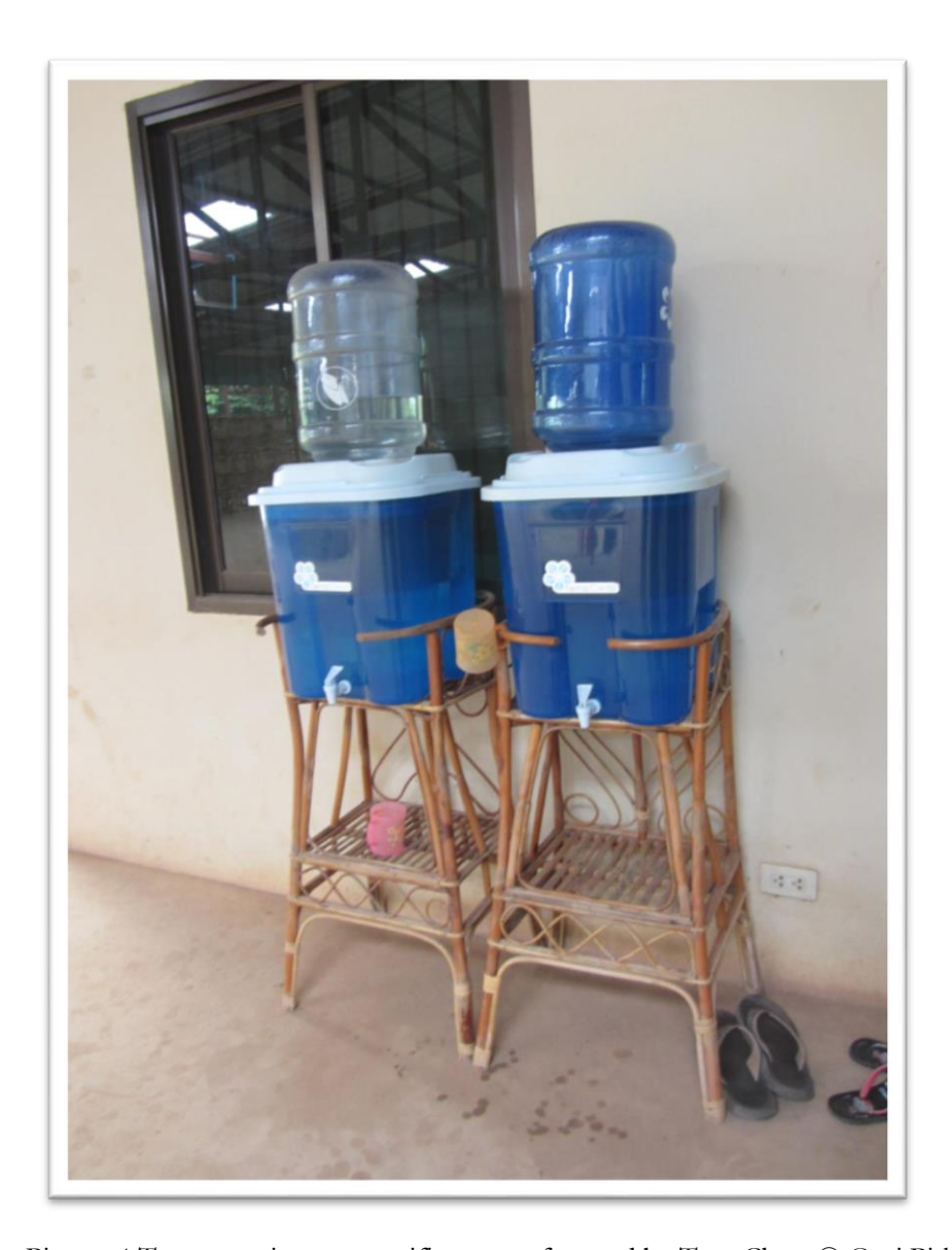
Picture 4 Two ceramic water purifiers manufactured by TerraClear

Ceramic water purifiers can have direct impacts on the health of the users through reducing water-borne illnesses. The direct benefits most often identified for CWPs are health benefits from the increased quality and quantity of potable water, enhanced indoor air quality, decreased expenditure in terms of both time and money in acquiring wood or water, reduced deforestation, and local employment creation, for example, in manufacturing, assembly, distribution, sales or marketing. Furthermore, the filters can improve the users' capacity to adapt to floods and droughts (WHO and UNICEF 2012).