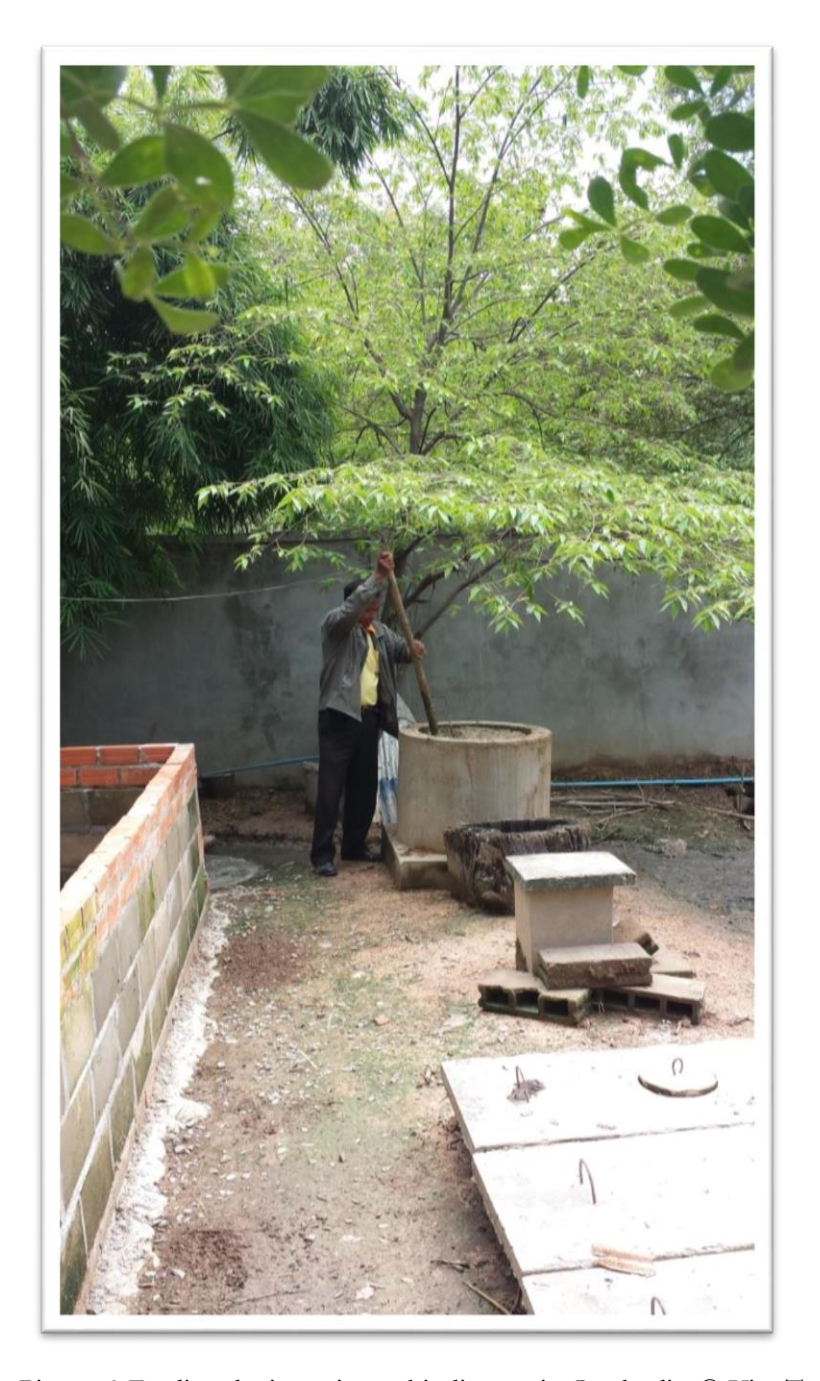
Picture 3 Feeding the input into a biodigester in Cambodia, © Visa Tuominen

Biodigesters have been associated with several different co-benefits. Most often cited benefits are the provision of cheap energy for the daily cooking and lighting needs of a family, replacement of wood with biogas that contributes to reducing deforestation, improved health conditions due to a reduction in indoor air pollution, enhanced nutrient preservation of soil due to applying organic bioslurry as fertilizer, monetary savings from the displacement of fuels and synthetic fertilizers that were previously bought, and local production and training of masons that contribute to economic development. Women are often identified as beneficiaries of biodigesters due to better air quality in the kitchen, faster cooking and reduced drudgery from provisioning of fuel wood or charcoal, and less work cleaning the kitchen since the dirt from burning wood or charcoal would be reduced. Some claim a reduction of health hazards from poor sanitation since the yards can be kept