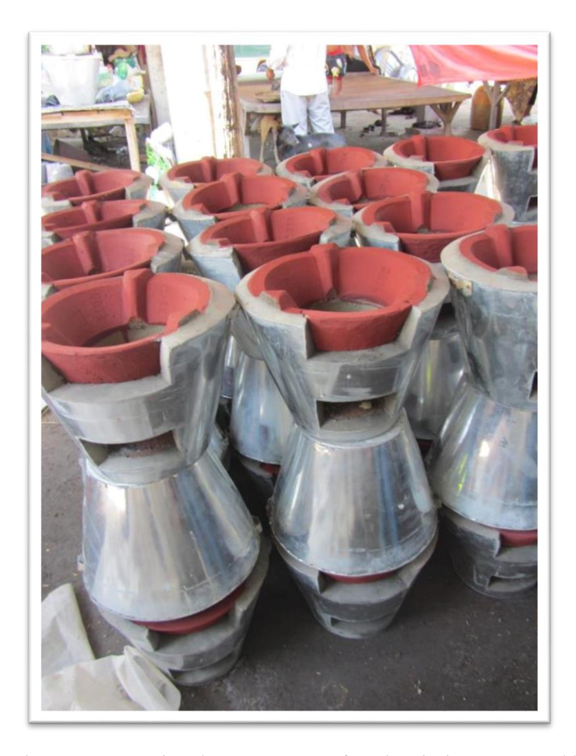
Picture 2 Improved cookstoves at a manufacturing site in Kampong Chhnang Cambodia

Since carbon financed projects need to generate additional emissions reductions, carbon-financed ICS projects are implemented in areas with demonstrable depletion of forest resources where the main fuel for cooking is non-renewable biomass, in other words, biomass from forest sources that are depleted at such as high rate they can be considered non-renewable. Improved cookstoves have received a lot of attention in the recent years in discussions on the health hazards from improved air quality. The sustainable development benefits identified for ICSs mostly include health benefits from improved indoor air quality, less pressure on forests and savings of time and money due to reduced fuel wood or charcoal consumption (GACC 2011). The health benefits from reduced indoor air pollution and the reduction in provision of wood or charcoal are cited to benefit especially women and children. The impact of biomass stoves on reducing indoor air pollution and health risks created by it is however, under debate (Simon et al 2014).