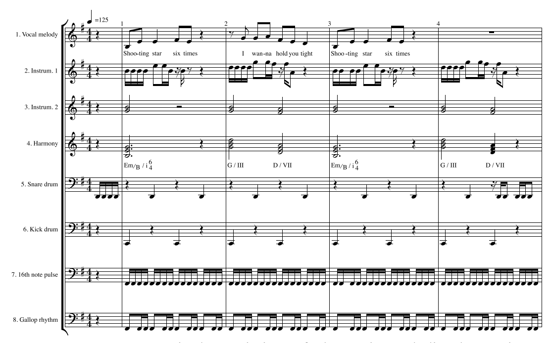
Picture 1. Notation/transcription of the main melodic, harmonic and rhythmic components of the target excerpt. From top to bottom: 1. sung melody and lyrics, 2. accompanying synthesizer motif, 3. quiet pad-like background chords, 4. the tonal harmonic progression (not explicitly sounding, my own rendering), 5. snare drum accompaniment, 6. kick/bass drum accompaniment, 7. "ticking" 16th note background pulse, 8. galloping rhythmic feel. The upbeat-like snare drum fill before measure no. 1 is included for its leading function, otherwise it will be left out from the analysis.

In fact, I will try to categorize the experiential wholes in terms of their sources of perceived motion, therefore, which component(s) of the musical texture (e.g., pitch, rhythm, timbre) the sensation can be associated with. I will also define the type, thus the subcategory of the motion (e.g., leaping or galloping). In addition to the written description, the result of this will be presented in a table. The categorization already at this stage of the analysis makes the stage of establishing the conceptual metaphors more straightforward. However, at this stage of the analysis, the categorization is merely a biproduct of establishing the potential sonic objects, and also a method that helps in accomplishing this task. So, it should be considered only preliminary. The search for the sonic objects and their potential sources of experienced motion (thus, pitch, rhythm etc.) will take place at different timescales. The potential sonic objects and their explicit characteristics demonstrated in this experiential analysis will form the source material of the second analysis chapter about the image schemas, conceptual metaphors, their affective dimensions, and how they can be suspected to have an impact on my music preference.