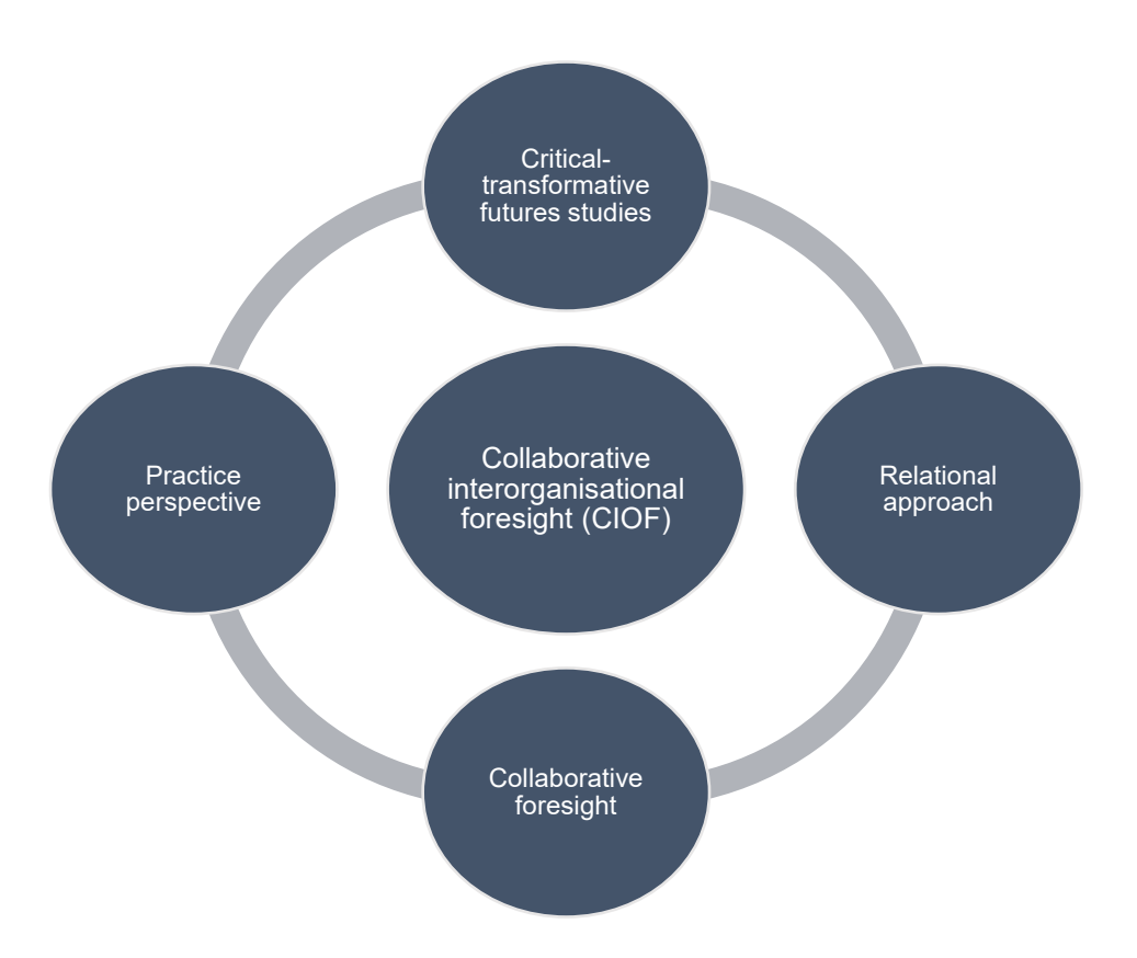
Figure 2. Theoretical perspectives.

describes dynamic and open systems for ideation that involve action-based projections of the future in a social context. The complex nature of practice-based CIOF highlights the role of several underpinning theories, including evolutionary innovation, actor-network theory, theories of cooperation and participation, and futures-focused methods and techniques (Havas & Weber, 2017). The principal contribution of this perspective is to frame contextual challenges, such as sustainability enhancement.