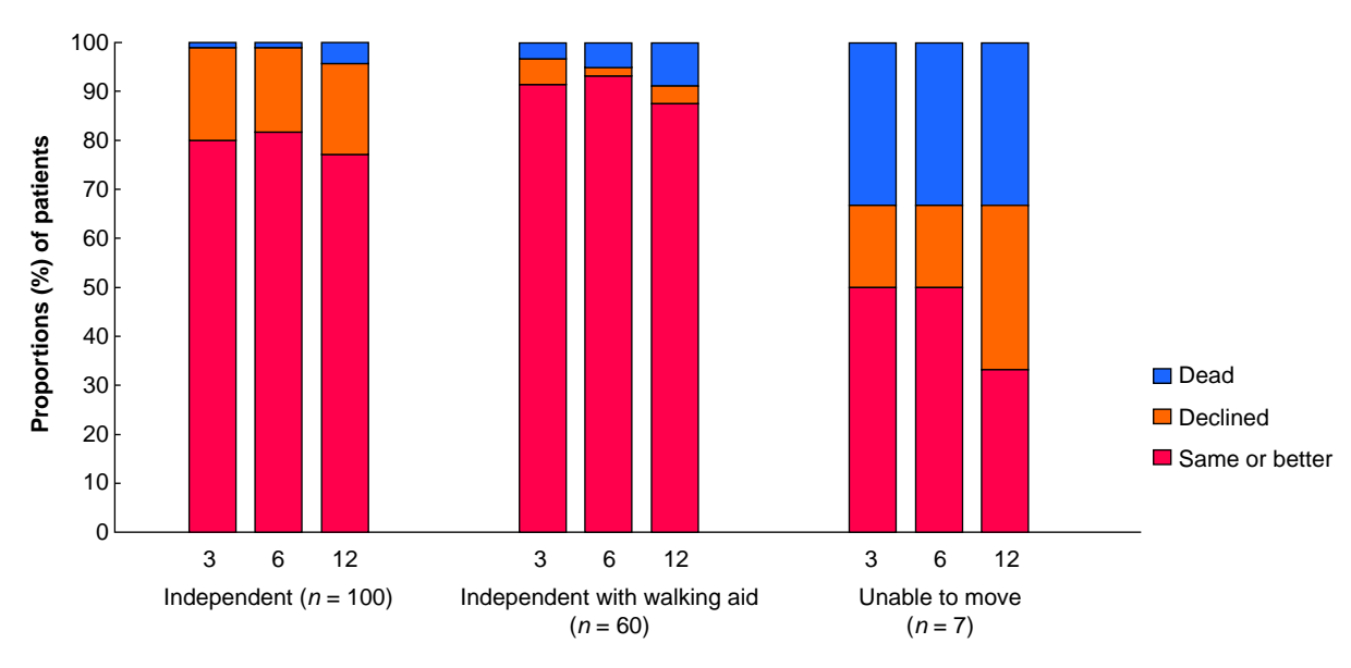
Fig. 1 Changes in need for support with activities in daily living at 3, 6, and 12 months after curatively aimed colonic cancer surgery (stage I–III) for patients aged 80 years or more