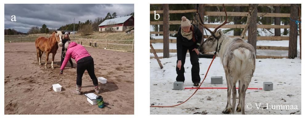
Fig. 5: a) Horse owner pointing at the left bucket. b) Unfamiliar experimenter pointing at the right bucket to a reindeer.

All the experiments happened in places familiar to the tested individuals and were video recorded for later analyses of the behaviours and latencies with the Behavioural Observation Research Interactive Software (BORIS: Friard and Gamba 2016).