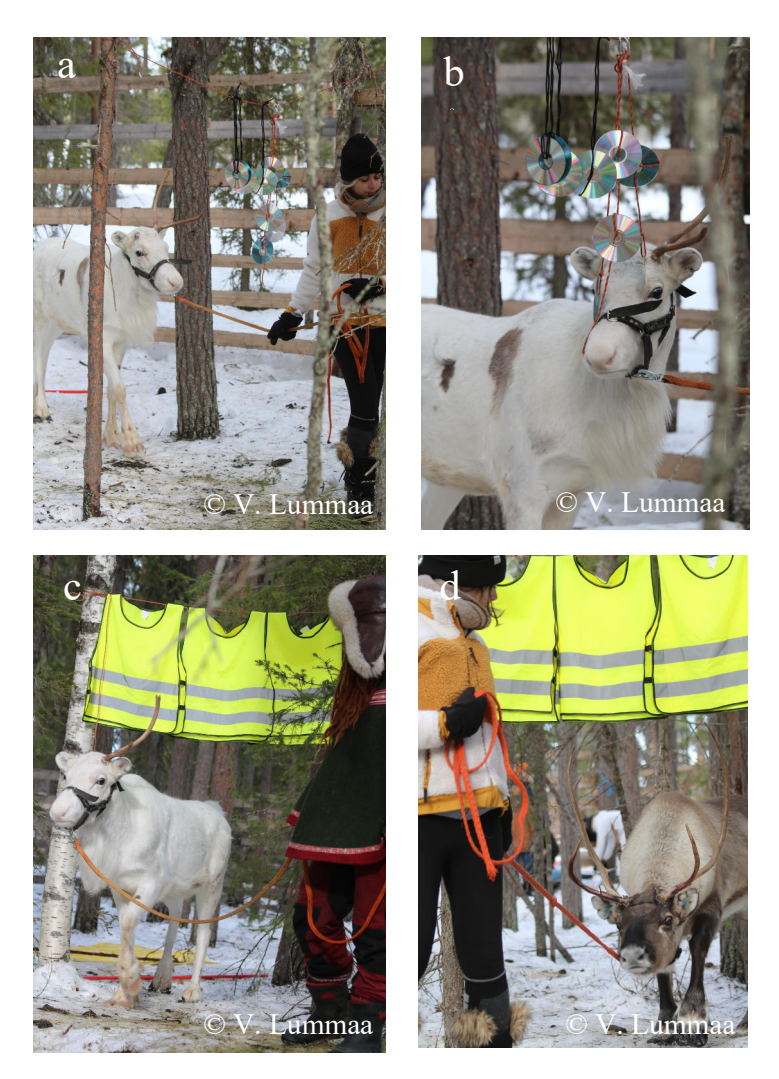
Fig. 3: a,b) Reindeer being led under the CDs arch. c,d) Reindeer going under the yellow jacket arch.

During the preliminary tests conducted with captive reindeer from the Nuuksio reindeer park, I realized that the novel surface may not elicit as strong reactions in reindeer as it does in horses or elephants. To further challenge them, I added another test involving a novel object. This test was conducted in the same manner as the previous novel surface test, except that instead of walking on the surfaces, the animals had to walk under two arches made of different materials. One arch had