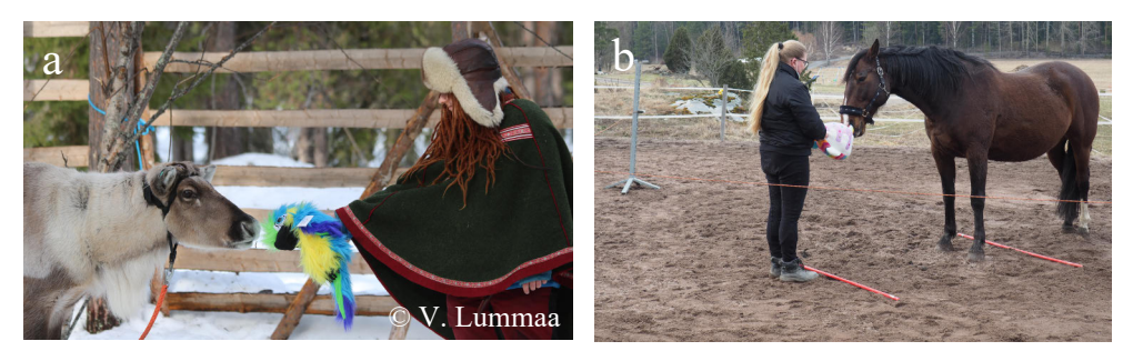
Fig. 1: a) reindeer being presented with a novel object. b) Horse being presented with a novel object.

In a second experiment, either the familiar handler or an unfamiliar experimenter presented a novel object to the horse or reindeer. The animal was given one minute to approach and interact with the experimenter and the object. After that, the experimenter attempted to approach the animal and touch it on the shoulder with the object (Fig. 1a,b). I measured the reluctance of the animal to be touched with the novel object and recorded the latency, or the time it took for the animal to approach and touch the novel object.