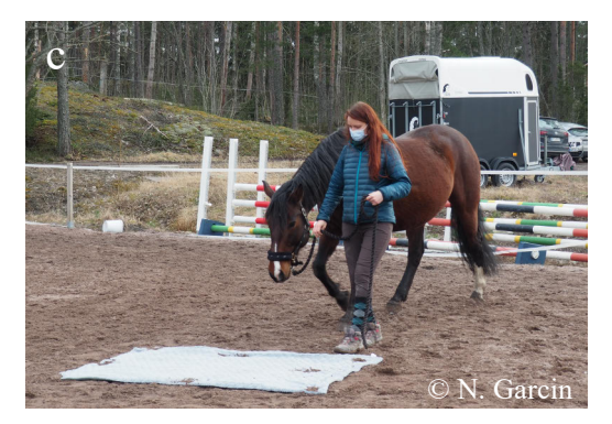
Fig. 2: a) Asian elephant crossing a plastic tarpaulin during the novel surface test. b) Reindeer interacting with the plastic tablecloth during the novel surface test. c) Horse being led onto the blanket during the novel surface test.