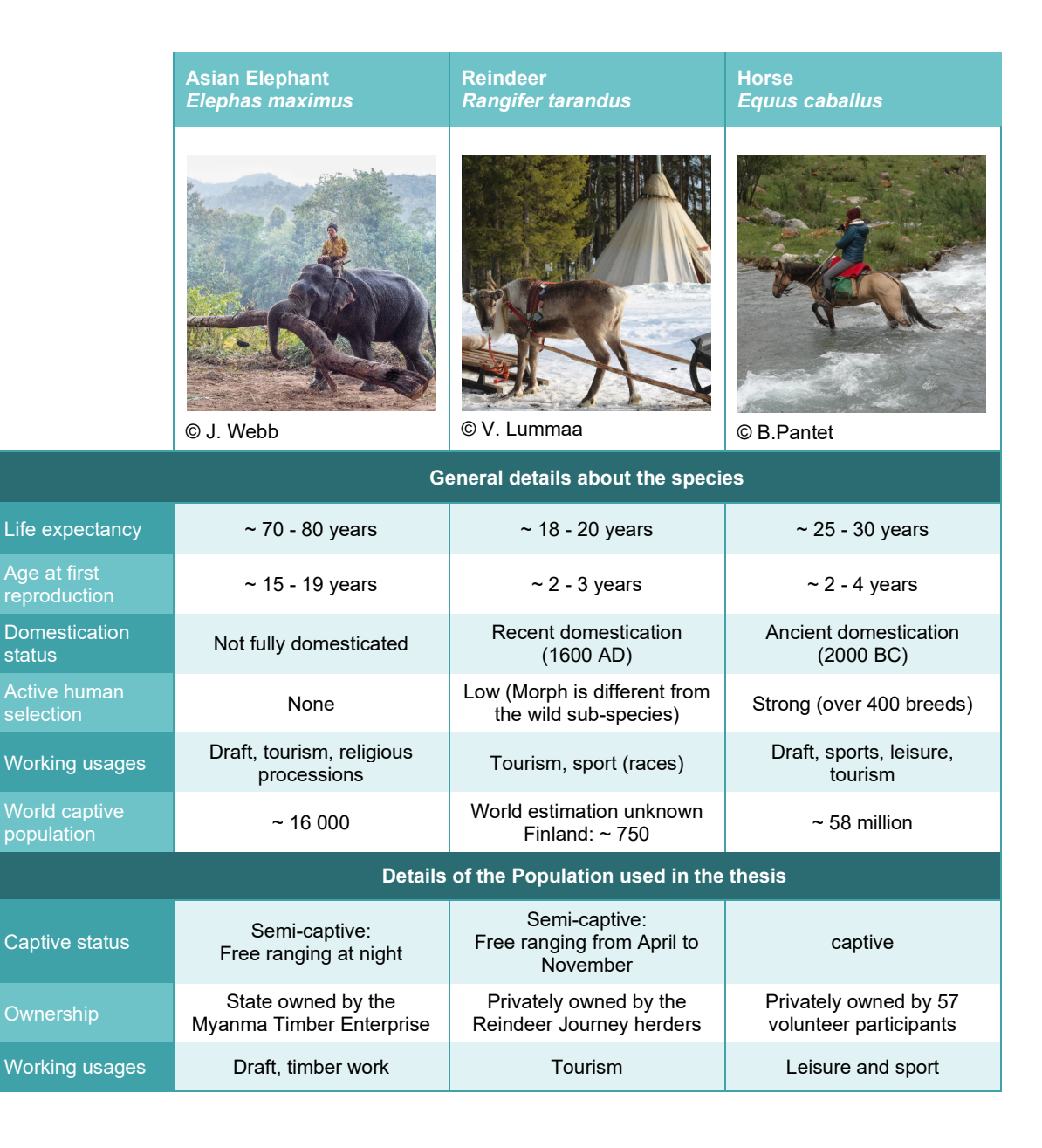
Table 2: Description of the three study species and populations used in this thesis.