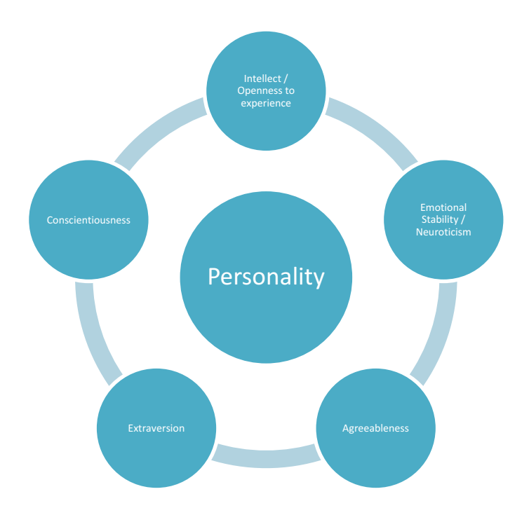
Figure 1 The Five-Factor model of personality (Goldberg 1990; 1992).