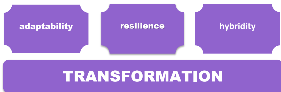
Figure 9. Buzzwords of our transformational futures.