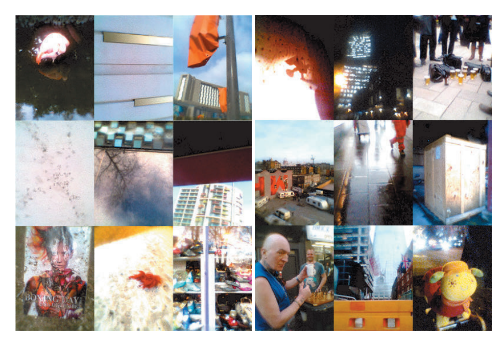
Figure 4. Two aquarelle like collages constellated from over 1800 images made with a Nokia 2690 non-smart phone.

a sheet of transformation which invents a kind of transverse continuity or communication between several sheets, and weaves a network of non-localizable relations between them. In this way we extract non-chronological time" (1986/1997b, 123).