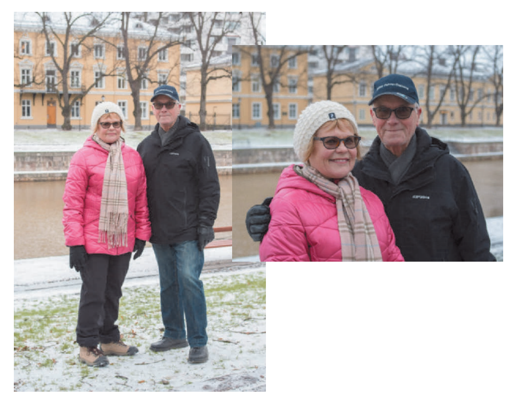
FIGURE 3. The framing is intensive not only as a result of the small adjustments made by the photographer, but also in the way the bodies relate to each other at the site of photography. I did not instruct the people I encountered on how to pose for the camera.

controlling the depth of field. By controlling the depth of field the photographed bodies are close to, yet separated from the River environment. In other words, when the background of the photograph is a continuous surface the relation between the body and the environment appears more fluid.