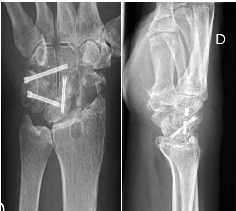
Fig 4a and 4b. X-rays of a patient operated early in the series. A sizable scaphoid remnant combined with radial wrist pain led to reoperation to remove the entire scaphoid.