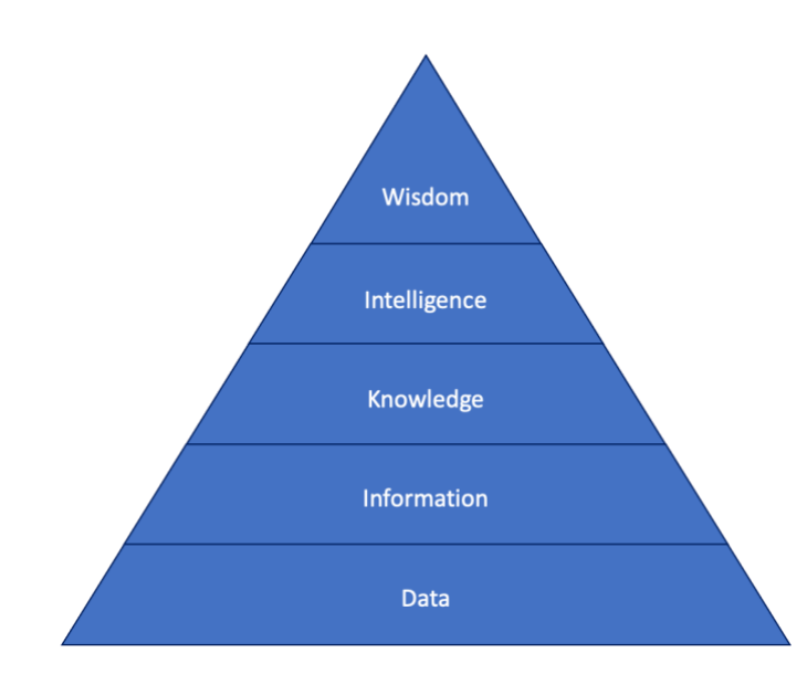
Figure 1. DIKIW hierarchy.

ethical literature on AI will be called as DIKIW hierarchy. In the following I will discuss the elements of the DIKIW hierarchy in information sciences.