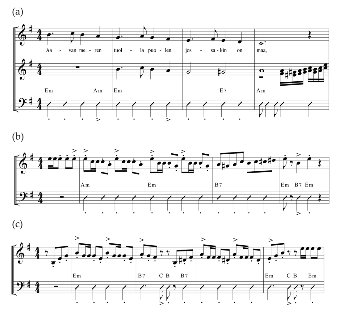
Example 4. Satumaa (music and lyrics by Unto Mononen): (a) section A; (b) introduction; (c) opening of the instrumental interlude. Sources: Taipale (2000); Kari & Airinen (2001).

To summarise, Satumaa is said to comprehend "the whole range of the Finnish mentality; longing, melancholy, nostalgia, dreams, sorrow and sadness described through nature" (Kukkonen 1996: 193). In regard to both music and lyrics, it looks nostalgically back on better times and better places.