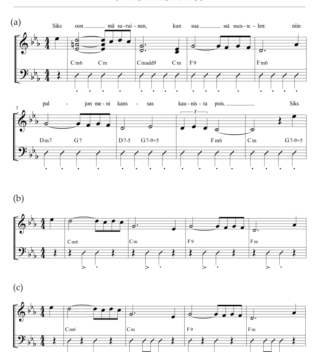
Example 3. Siks oon mä suruinen (music by Toivo Kärki, lyrics by Kerttu Mustonen): (a) section A; (b) opening of the introduction; (c) opening of the instrumental interlude. Sources: Virta (1998); Kari & Airinen (2001).

Like the lyrics of many other wartime and post-war tangos, written by Mustonen