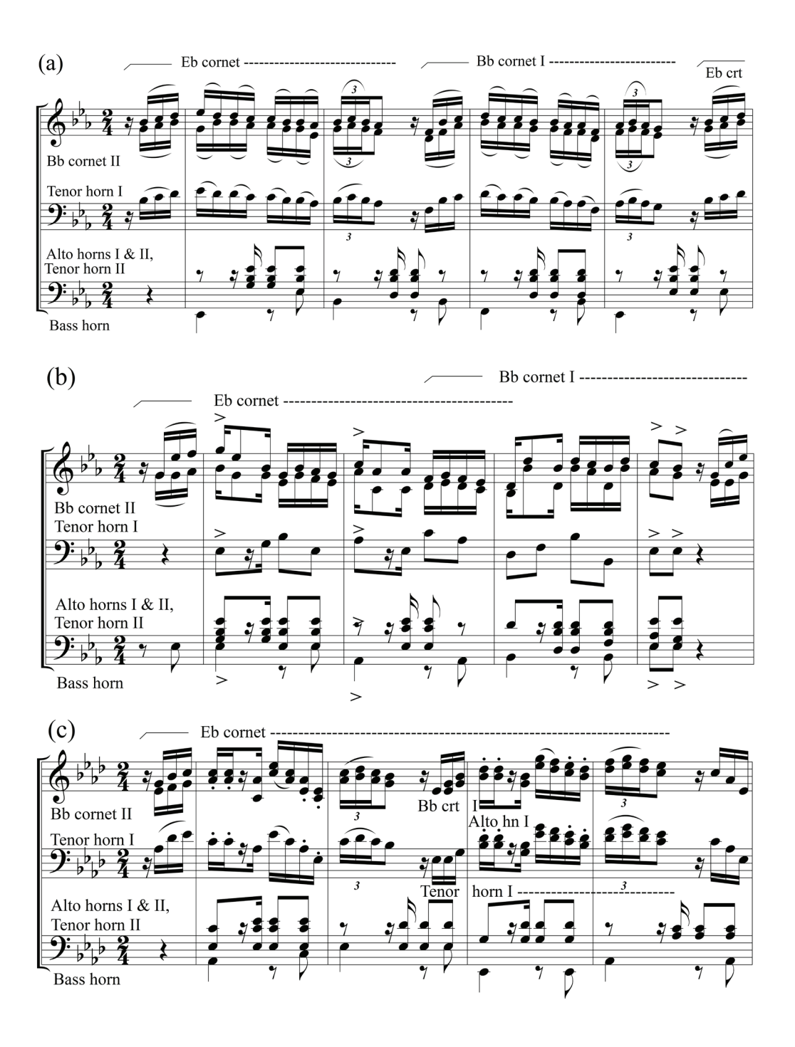
Example 1. Tango (Alexander Björk): (a) opening of section A; (b) opening of section B; (c) opening of section C.