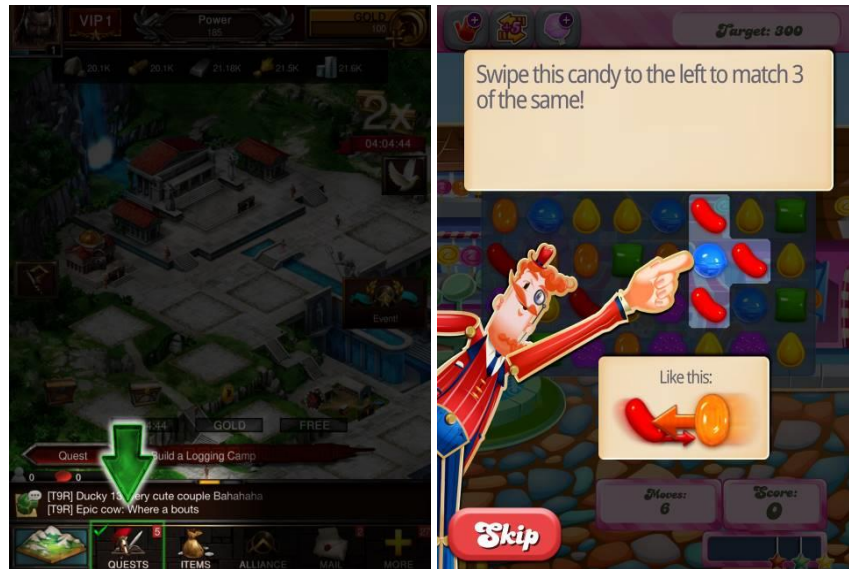
Figure 3: Tutorial phases in Game of War - Fire Age and Candy Crush Saga .