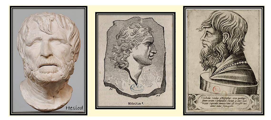
Fig. 1. (left) Hesiod, Greek poet (Theogony & Works and Days), (middle): Mithridates VI, king of Pontus and a pioneer of toxicology, (right): Cleobulus of Lindos, poet and one of the Seven Sages of Greece.

personalized, gene-based, therapeutic approaches are being developed. Hippocrates also highlighted the influence of the environment on health, setting the fundamentals of what we know today as epigenetics. Indeed, current scientific evidence has shown that environmental exposure can up- or down-regulate particular genes [3] and can therefore influence the response to a particular dose.