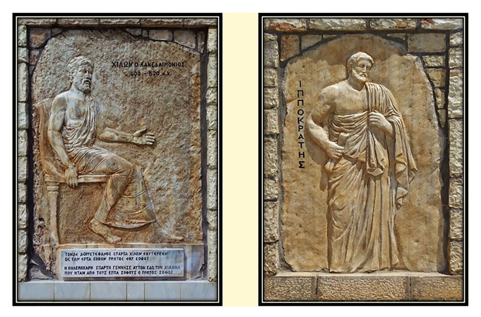
Fig. 2. (left) Chilon of Sparta, politician and philosopher, and one of the Seven Sages, (right) Hippocrates, the Greek physician called 'The Father of Medicine'.

the time was the most important source of toxins. His interest in clinical toxicology was also demonstrated by experiments he conducted on prisoners, in order to test poisons and antidotes. Mithridates came across a paradox, still studied today: lethal toxic substances can be beneficial when ingested in microscopic doses. It is reported that Mithridates acquired resistance to poisoning possibly by enzymatic activation or metabolic functional changes (mithridatism), by taking progressively increasing sublethal doses. For instance, tiny amounts of arsenic over time lead to hepatic production of enzymes, for the neutralization of a normally lethal dose. Mithridatism is not effective against all types of poison. Depending on the toxin, this practice might lead to lethal accumulation of poison in the body. He, however, should be given some credit for developing the ideas of tolerance, hormesis and immunity.