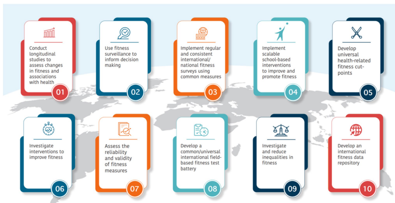
Fig. 2 Top 10 international priorities for physical fitness research and surveillance among children and adolescents identified by international experts in fitness

Australia, have recently scaled back ongoing national fitness surveillance efforts [52]. National fitness surveillance efforts in Slovenia identified a 13% decline in the fitness levels of youth aged 6–15 years following 2 months of COVID-19-related lockdowns [53]. Other countries used national fitness surveillance to identify regions/groups with low fitness levels and in need of intervention [54]. The approach to incorporate national fitness surveillance efforts have also been used to track the effectiveness of national policy efforts aimed at increasing the physical activity levels of children and youth in the school context [55]. Countries could further benefit from leveraging the measurement of physical fitness (CRF and MSF) to inform and track the effectiveness of policy and programming to improve the health of children and adolescents.