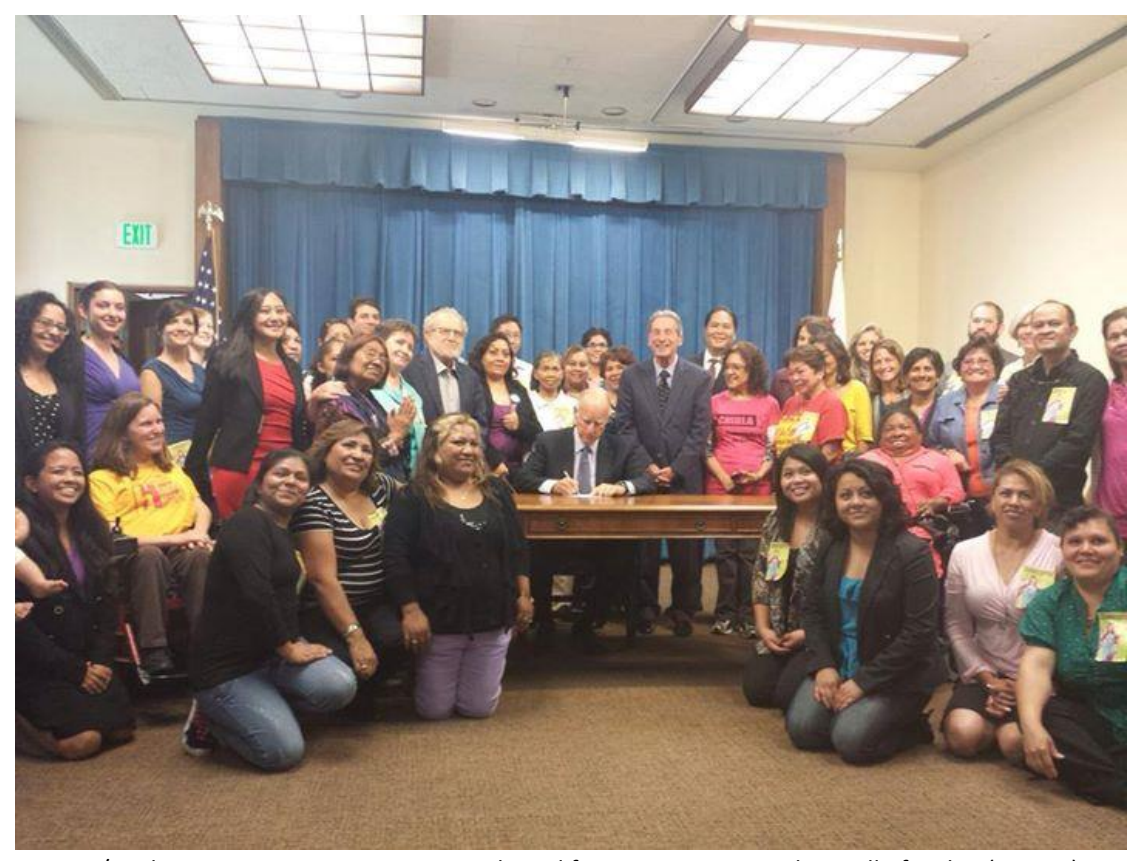
Caption/credit: Governor Jerry Brown signs the California Domestic Workers Bill of Rights (AB 241) into law on September 26, 2013.

Part one summarizes the provisions in enacted bills of rights with a focus on enforcement mechanisms. Part two updates the legal status of the revisions of the Obama administration that would extend FLSA protections to home care workers employed by third parties and redefine "elder companion" and "care" so to end the exclusion of these workers from overtime. Part three presents laws and policies from other nations, which suggest the range of arrangements that different political economies establish to define labor markets for household work. It also summarizes the ILO convention. Part four assesses models of enforcement: civil litigation; state agency (Department of Labor, Attorney General, and/or Human Rights); state employment bureau/public authority; worker center/NGO; and worker ambassador/grass roots monitoring. Some of these approaches overlap; all of them contain elements that together can enhance the rights of workers and employers of household labor.