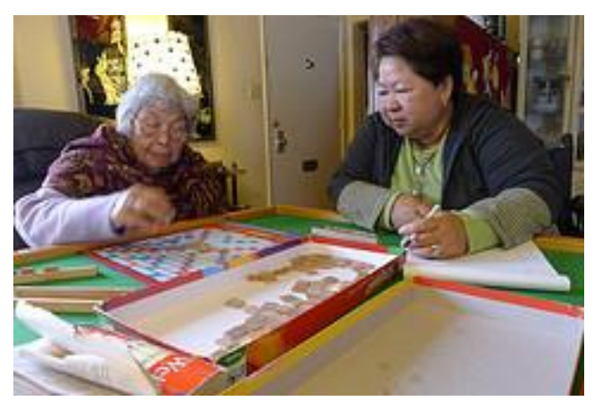
Domestic Care Worker providing crucial care work in the resident's home.