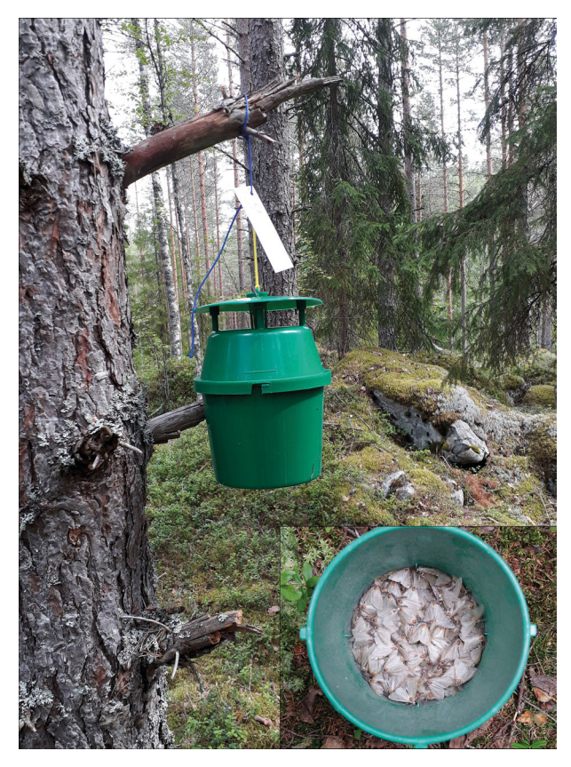
Fig. 2. The type of pheromone trap used in the survey installed on a Scots pine. The nun moths are trapped in the lower container part of the trap (the zoomed image). In the image, the typical black-white colouring has been lost from the wings of the densely packed moths.

The traps were placed at a height of 1.5–3 meters from ground, which has been found to be optimal for pheromone trapping of this species (Skuhravy 1987; Wang et al. 2017). Total number of traps was 58 in 2018 (+ 13 glue-based traps) and 137 in 2019 (funnel traps only). Based on results from 2018 as well as from other studies (Hielscher and Engelmann 2012), the 2019 trapping was conducted predominantly between 10th of July and 30th of August. This is the main period