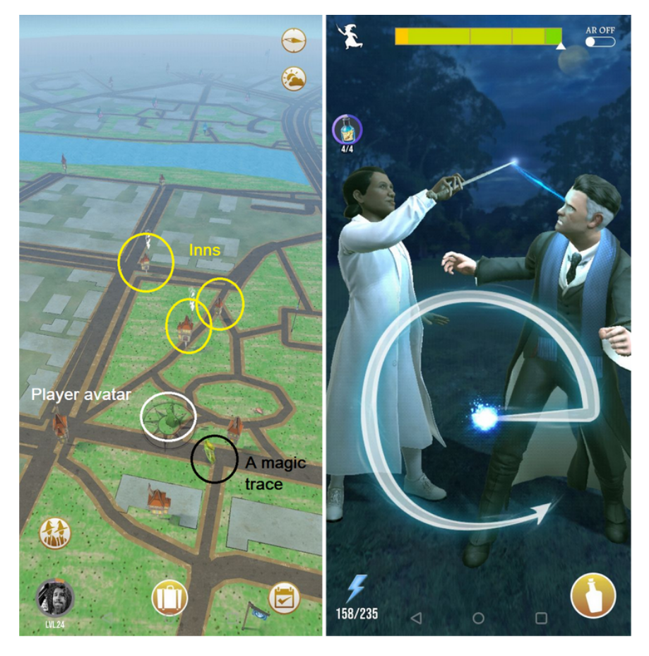
Figure 1: Two screenshots from HPWU