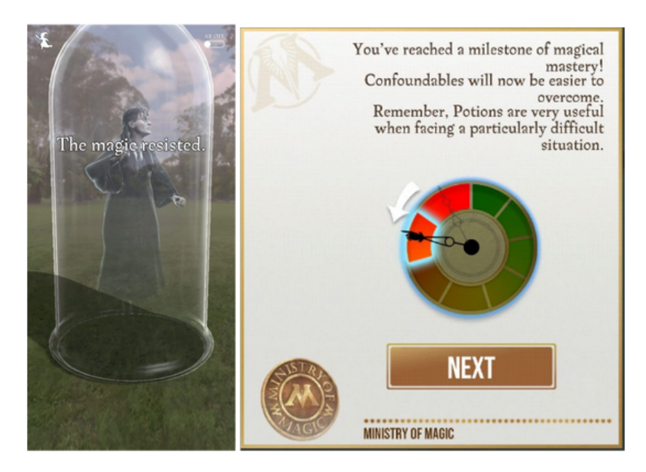
Figure 2: Screenshots from HPWU showing the trace minigame and a progression pop-up

GO, the games share a lot of similarities in their design. These similarities include: