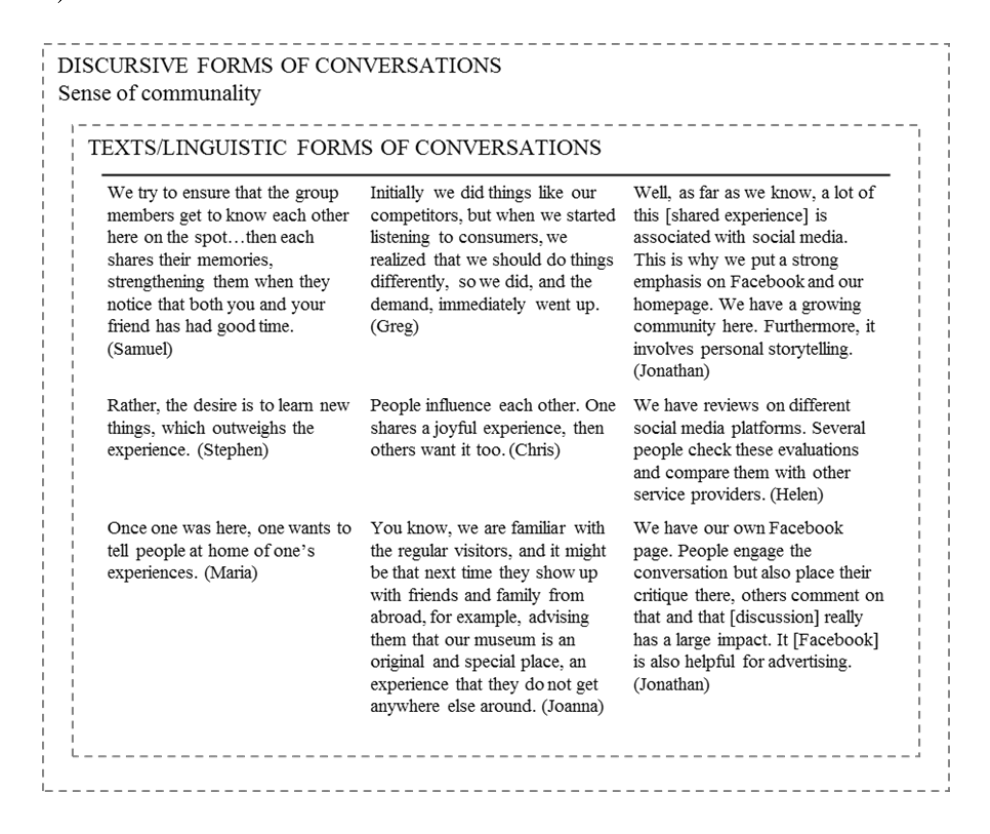
Figure 2 Examples of linguistic forms from the sense of communality discourse

Somewhat paradoxically, while the entrepreneurs recognized that consumers seek individual experiences, these experiences are stronger and more meaningful when shared with others. The interviewees referred to how consumers use products and services to achieve a sense of belonging to a certain community of consumers (Figure 2).