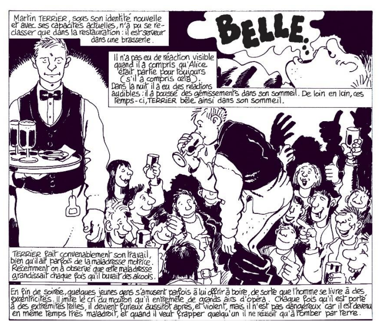
Figure 2. Terrier – like father, like son La position du tireur couché, Manchette (texte), Tardi (ill.). Futuropolis, 2010, p. 100. © Tardi / Futuropolis / Dist. LA COLLECTION

In POSBD, the text is transposed directly but it is accompanied with a repetition of a picture of Terrier's father shown above (POSBD, p. 30), who had also got a bullet in his head and ended up as a drunken waiter in a bar. The exact same image is repeated at the end (POSBD, p. 100) to illustrate that Terrier's destiny goes in line with his father's, thereby creating another kind of never-ending loop.