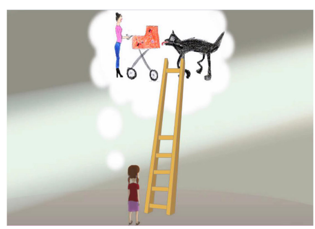
Figure 4 The children and parents work together to plan the ladders for the child's stepwise progress towards the most feared and avoided situations.

psychotherapists. They review the progress made by the child and parents, introduce new skills, help solve problems and provide support and encouragement. The programme content, including the telephone calls, is structured so that all the families get the same treatment. Telephone calls are recorded to ensure the fidelity and quality of the treatment and the participants are informed about this at the start of each call.