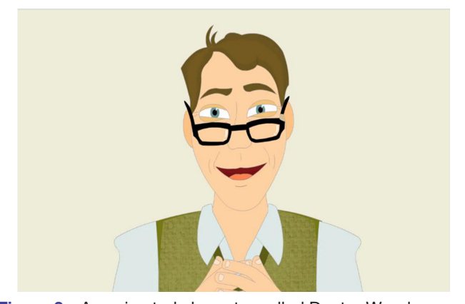
Figure 3 An animated character called Doctor Wunderman provides psychoeducation about anxiety and fears, adapted to the child's developmental stage.

The coaches are healthcare professionals, such as public health and psychiatric nurses with special training to deliver interned-assisted cognitive-behavioural interventions. The training includes a 2-week face-to-face training including theory on anxiety and cognitive-behavioural therapy. Additionally, independent reading and pairwise practicing theme by theme, supplemented with recordings and supervision, is required. The same coaches have earlier delivered an internet-assisted parent-training programme during an RCT and an implementation phase. 43 44 They receive weekly supervision from a team including, for example, clinical psychologists and