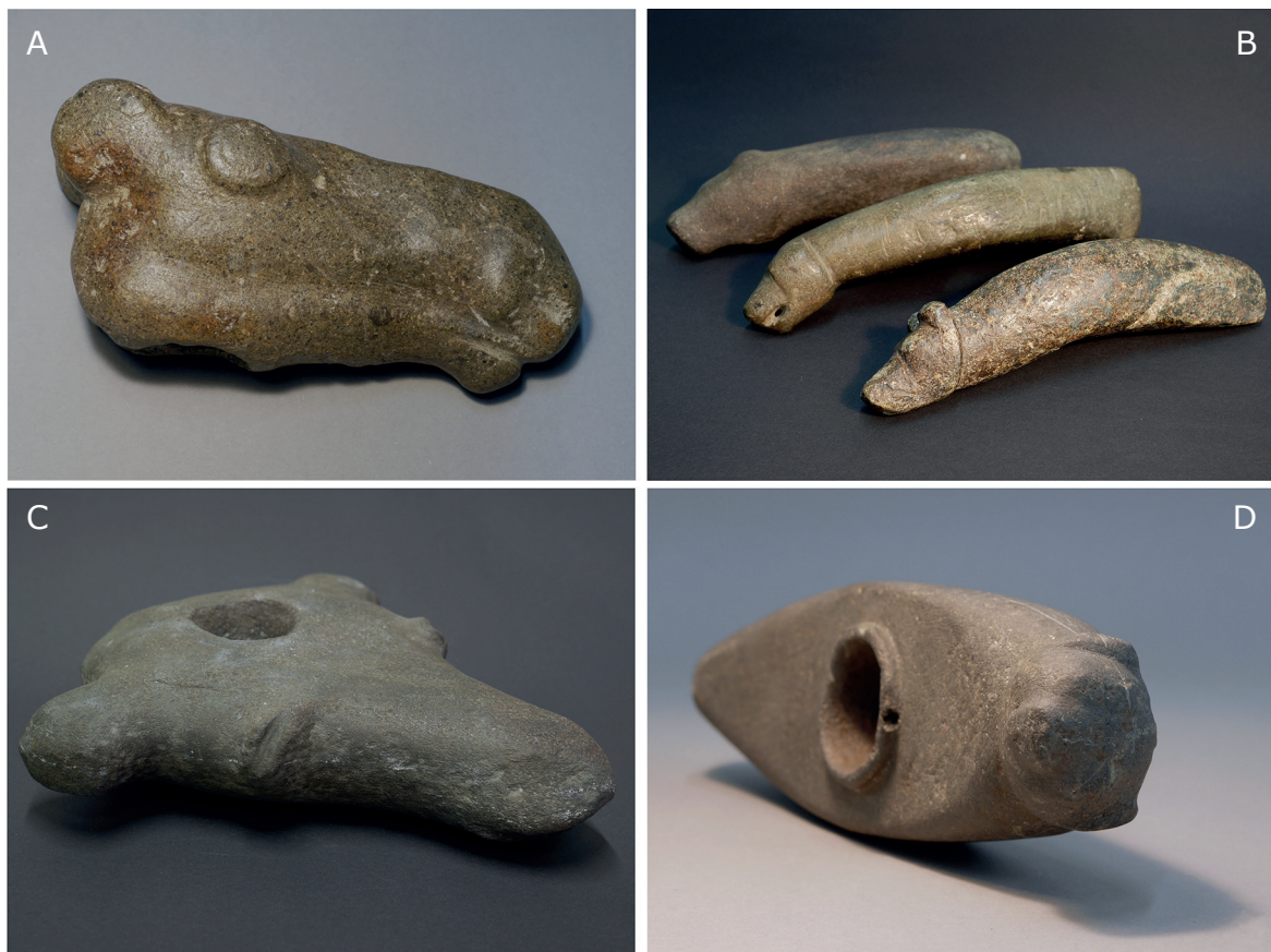
Figure 5.1. Zoomorphic stone maces and axes from Finland. A – Huittinen (KM 6292). B – From the back: Heinävesi (KM 8946), Antrea (KM 1557), Paltamo (KM 13275). C – Espoo (KM 2611). D – Ruukki (KM 27910). Not to scale.

According to our view, there are a total of 52 stone maces or axes in north-eastern Europe that are likely to represent animal-heads (Tab. 5.1). Of these, 18 items, or 35%, are unmistakable bear-head axes. The bear is thereby the predominant animal species depicted on stone axes, but interestingly hardly ever represented on maces. The next largest group consists of elk-headed items (both maces and axes), represented by 11 finds, or 21%. The rest of the zoomorphic maces and axes (23 items, or 44%) depict other animal species, or are alternatively so fragmented or abstract that it is not possible to ascertain the exact species they are intended to portray. Among the animals represented on axes and maces, however, there seems to be a variety of species including seals, fish, as well as terrestrial and amphibian species.