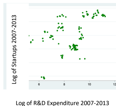
Figure 02. Start-ups by R&D expenditure of European countries

On the other hand, the relationship between R&D expenditure and start-ups is also linear and positive as shown in Figure 2. However, the dispersion around the regression lines show the variation considerably in effectiveness of EU countries with which they transform the R&D expenditure into start-up firms. Simply, they vary in their ability for technology commercialization.