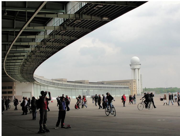
Fig. 3 Tempelhof Airport, Berlin