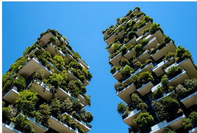
Fig. 2 Bosco Verticale, Milan