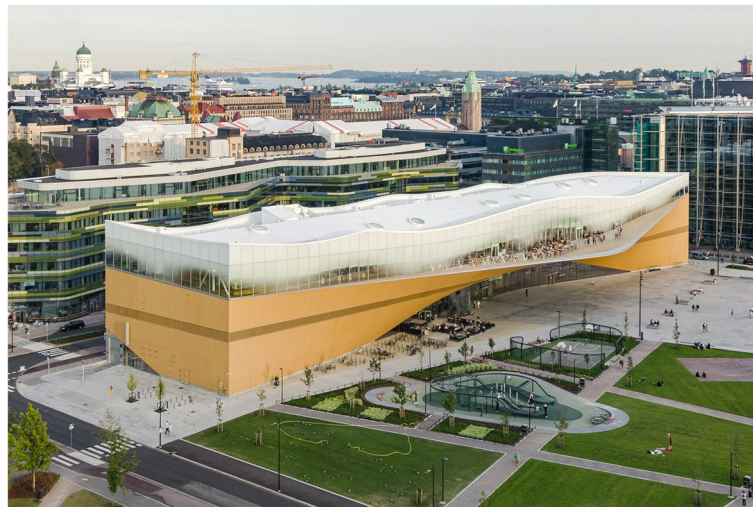
Fig. 1 Oodi Library, Helsinki