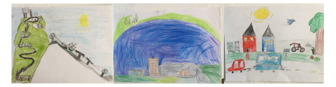
Figure 2. Mountain landscape drawn by a Norwegian 5th grader (77NB10C5), representing physical well-being slalom activities by himself ( left ); water landscape by a Finnish 3rd grader (41FG9C3), representing a mental landscape ( middle ); and a yard in a village/city drawn by a Norwegian by 5th grader (82NG10C5), representing social well-being ( right ).

In the Finnish 3rd and 4th graders' landscapes (see Figure 1A), water, forests and yards were presented often. The students drew archipelagos, lake districts and small forests near home or summer cottages, while mountains and fields were seldom present in their drawn environments (see Figure 2). The Norwegian 3rd and 4th graders drew water, forest, yards and mountain landscapes. They did draw street, meadow/park and field elements, but they existed in a minority of the landscapes. In their landscapes, rivers, seas or ponds represented water elements, and they were placed in the vicinity of a home, summer house, forest or park. A yard was combined with a family's regular house or summer house or with a block of flats. Mountains were more common in the Norwegian 3rd and 4th graders' drawings than in those of the Finnish and Swedish students. The Swedish 3rd and 4th graders often drew water, meadows and parks in their landscapes. Their second favourite was forest and yard areas, and the third was mountain and field (agriculture) elements. In the Swedish students' drawings, street or road scenery near a home or theme park in the surroundings was often presented. They also drew a meadow or park with a few trees and lots of open spaces with flowers and animals.