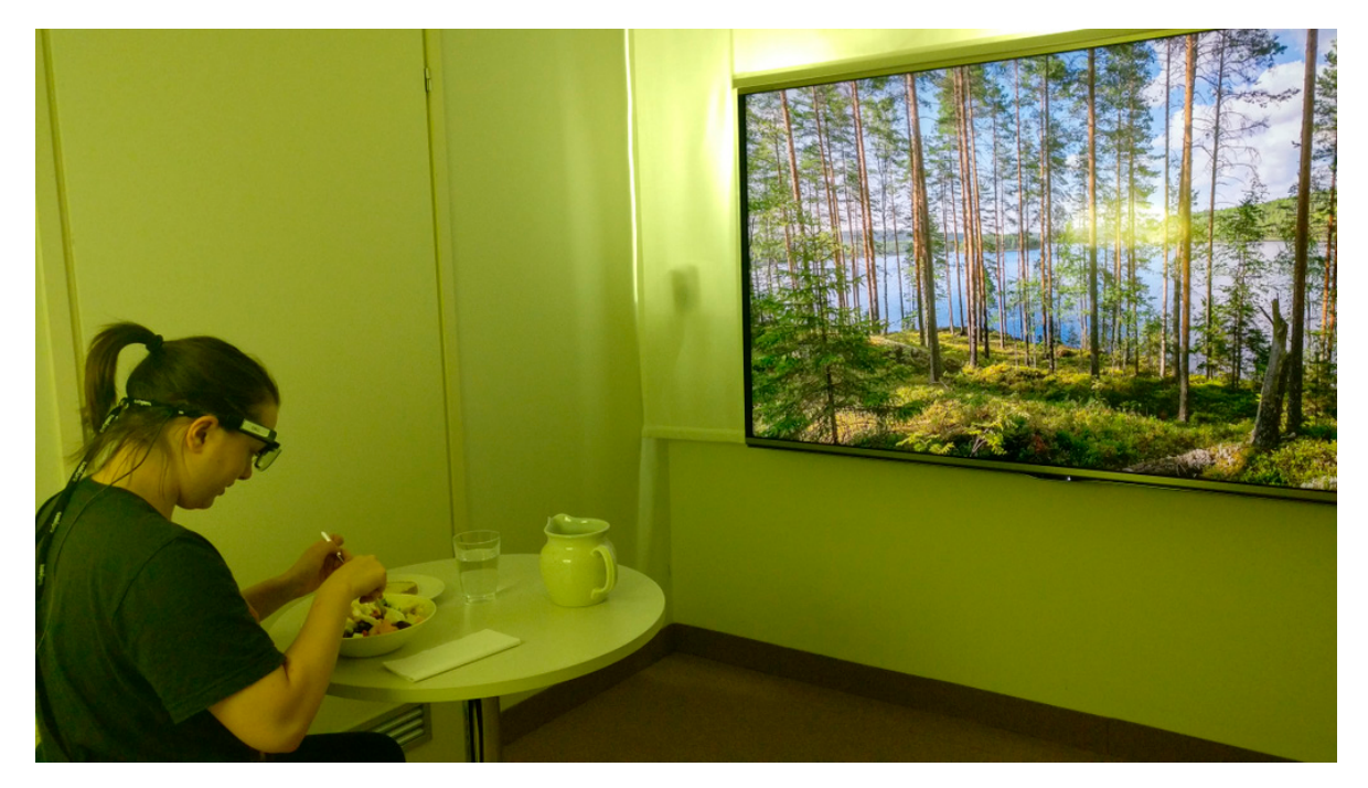
Figure 2. Lunch under a multisensory condition.

The multisensory laboratory equipment included an odor diffuser (Pump unit BB-200, @aroma GmbH, Berlin, Germany) and controlled illumination (five bulbs on the wall and three bulbs in a floor lamp, Hue, Philips, Amsterdam, Netherlands). The audio-visual multimedia system included an 80-inch Apple-tv (Apple Inc., Cupertino, CA, USA) and an audio system with two speakers (Genelec Oy, Iisalmi, Finland). In the control condition, the neutral room lighting system was used. In addition, there was no sound, no scent and no visual landscape on the screen. In the multisensory condition, there was a landscape of a pine forest and lake during summertime and bright lighting, matching the color tones of the landscape on the screen (Figure 2). The soundscape was birdsong in a Finnish summertime forest with various species of bird (recorded in Kortesjärvi in June). Orange scent (Orange Oil Sweet Brazil Pera, @aroma GmbH, Berlin, Germany) was diffused to the room with an odor diffuser for 30 s before a subject entered the room and then for 5 s in 3 min intervals until the subject had finished eating.