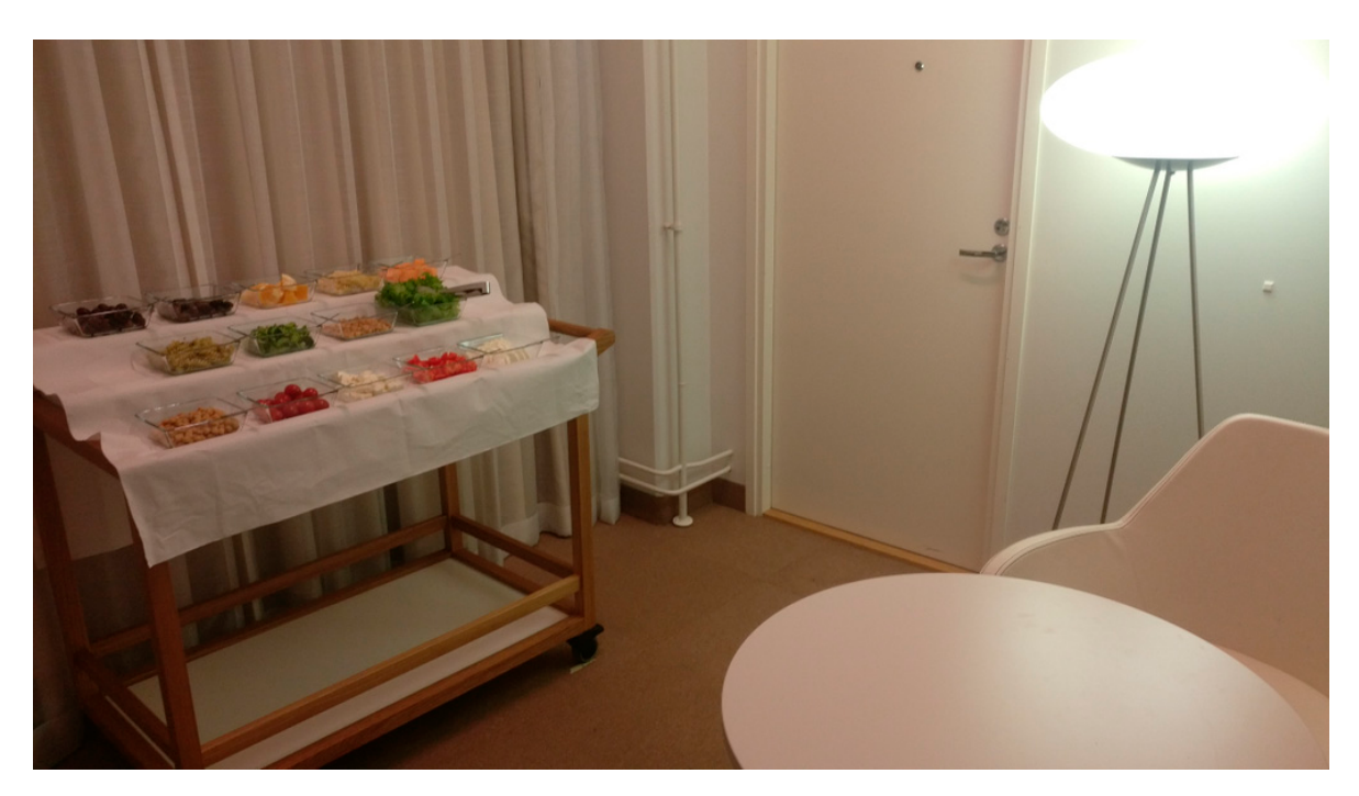
Figure 1. Serving trolley with the buffet foods.

Food items were delivered weekly by the same local supermarket and the quality of the vegetables and fruit was carefully monitored daily. The food was prepared fresh daily in the kitchen of the sensory laboratory just before the session for each participant. After finishing the preparation, the serving trolley was kept in the cold storage room at +8 °C. The weights of the served and consumed amount of the foods were measured with a scale (Mettler Toledo PB3002-S, Mettler Toledo International Inc., Columbus, OH, USA), to 1 g accuracy. The foods were served in square-shaped 15 \times 15 cm glass bowls. The bowls were placed on the serving trolley on three different levels (Figure 1). The order of the serving bowls was randomized for every subject.