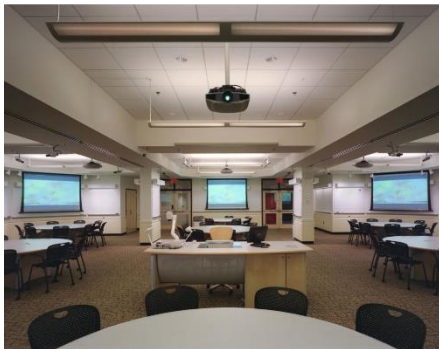
Figure 1. An active learning classroom

students and teachers, and instructional strategies enabled or rendered difficult by different kinds of spaces, although the volume of such research is now starting to expand (e.g. Beery et al. 2013; Brooks, 2012; King et al. 2015; Temple, 2014). Not least in this burgeoning field has been the influential work and research on so-called active learning classrooms (see Brooks et al. 2014, for an overview). The spatial design of such classrooms is rather standardized; they are commonly large and are equipped with round tables and chairs, each table hosting laptops or stationary computers for approximately 8–10 students; and the walls tend to have several screens (Figure 1). The students work actively and discuss their questions and solutions with the teacher, who has more of a supervisor’s role than that of lecturer delivering to the students in the ordinary classroom. Systematic studies have shown that students’ performance improves when working more actively with the course contents than in traditional classrooms where the students are less active and the teacher has the role of transmitting knowledge to them (Dori & Belcher, 2005; Brooks, 2011).