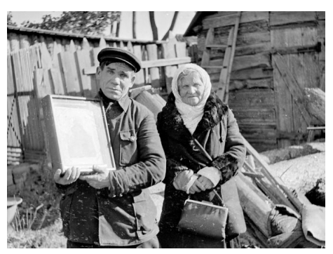
Fig. 2 Hanneriina Moisseinen, The Isthmus (2016), 172–173.

Theorizations of empathy in relation to photography seem to revolve around the act of photographing, while texts focusing on the empathy created by looking at photographs are far scarcer. Some theorists who do discuss the relationship between empathy and