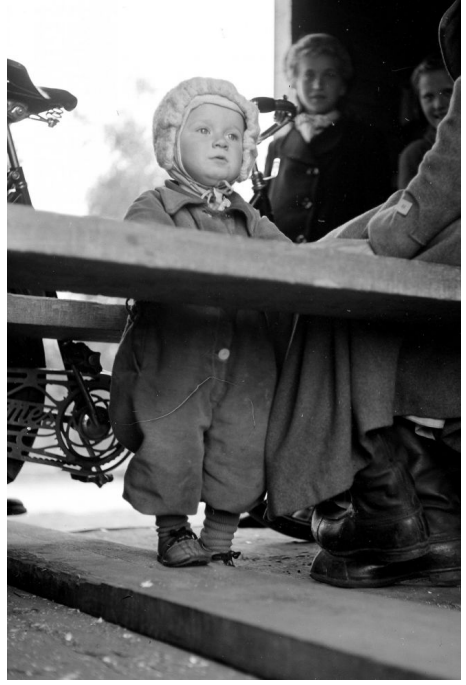
Fig. 3 Hanneriina Moisseinen, The Isthmus (2016), 210–211.

The arresting quality of photographs can be seen at play in the multiple photos of Karelian children, and of young animals such as kittens (see fig. 3 and fig. 4), reproduced in the pages of Moisseinen's comic. Through these images of infants, the vulnerability of humans and animals alike in times of war is underlined. Barthes has written extensively on the connection between photography and death, and it is the defeat of time and the inevitability of death that,