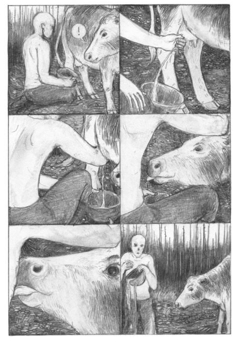
Fig.8 Hanneriina Moisseinen, The Isthmus (2016), 79.

Moisseinen herself argues that it is the power of storytelling which makes the death of the calf grievable for the reader: "Although the reader understands that the narrative is fiction, it is precisely the narrative that makes the calf a sympathetic and a vulnerable animal. The death of the calf touches; it becomes the turning point of the whole story." Moisseinen's argument for the narrativization holds true. The death of the calf becomes a decisive and emblematic point in