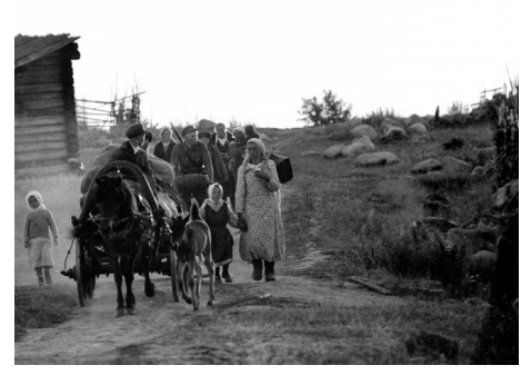
Fig. 1 Hanneriina Moisseinen, The Isthmus (2016), 16–17.

This sequence functions as a prologue, visualizing the themes of loss and departure. We see