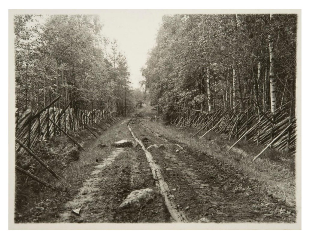
[Pic. 8] Tyyni Vahter, Alley between Rautala and Mattinen (1937) (Polvijärven kirkonkylä, Eastern Finland) B&W Photograph, 9 x 12 cm CC BY 4.0 Finnish Heritage Agency, Inv.-No. KK2121:103