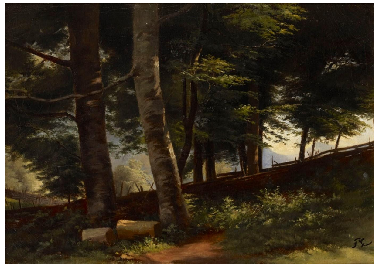
[Pic. 3] Fanny Churberg, Metsänsisusta (Forest interior, 1871–72) Oil on canvas, 33 x 46,5 cm Copyright Free, Finnish National Gallery, Inv.-No. A III 2341

The next generation after Churberg and Lindholm, led by Albert Edelfelt (1854–1905) and the artists who trained in Paris during the Belle Époque (1880s-1890s), like Victor Westerholm (1860–1919),