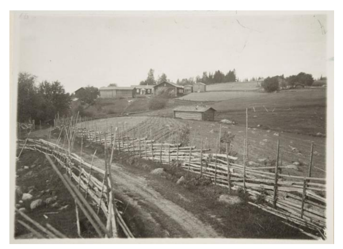
[Pic. 7] Eino Nikkilä Eino Liitiä's farmer house in the village of Juhtimäki (1931) (Near today's Seitseminen National Park) B&W Photograph, 9 x 12 cm CC BY 4.0 Finnish Heritage Agency, Inv.-No. KK1739:302