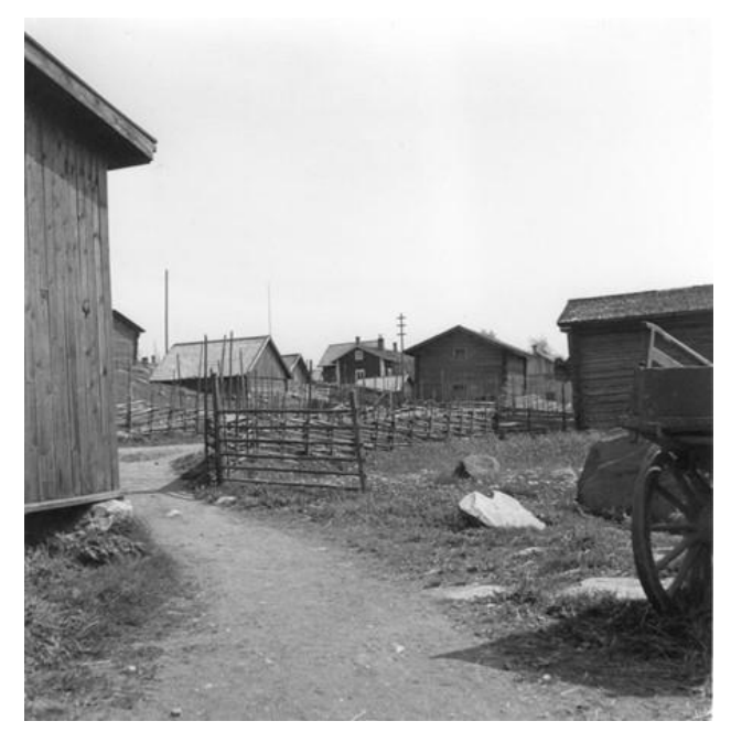
[Pic. 6] Esko Aaltonen Village of Lunkaa in Tammela CC BY-NC-ND 4.0 Forssan Museo, Inv.-No. EA3551