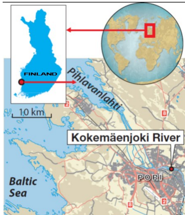
Figure 1. Location of the study area.

The Kokemäenjoki River estuary – Pihlavanlahti Bay – in western Finland (Northern Europe; 61°34'N, 21°40'E; Figure 1) is brackish water–freshwater ecosystem, where the deposition of river-borne sediments, the land upheaval, and the accumulation of autochthonous, locally produced plant material is more rapid than in any other river delta in the Northern Europe [1],[2]. The estuary, discharging into the Bothnian Bay, the northern section of the Baltic Sea, is a shallow sedimentation basin, which is nearly thoroughly covered with rich and exceptionally productive macrophytic vegetation [3],[4]. The delta in the estuary is proceeding very rapidly due to the deposition of sediments carried by the River Kokemäenjoki, the accumulation of autochthonous organic (plant) matter, and due to land uplift, typical to the shores of the Baltic Sea. At present, the extent of the land uplift in the area is 5.5 millimeters a year. The deltaic deposits (formation of new sandbanks and islands), as well as the distribution of the vegetation zones are today moving towards the sea at an average speed of 30–40 meters a year [5], [6].