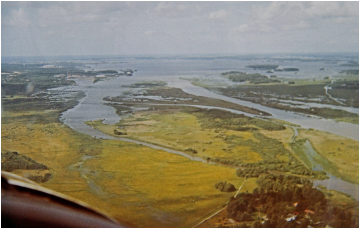
Figure 2. Aerial view of the Pihlavanlahti Bay in mid 1970's.