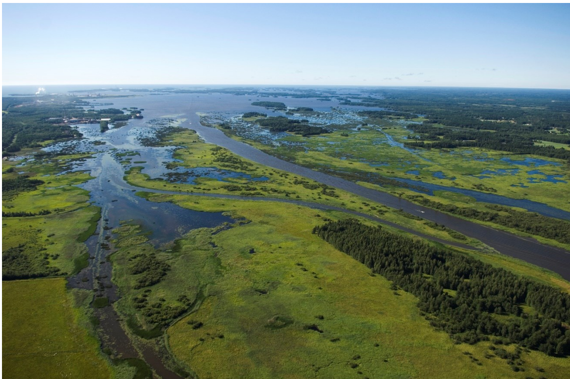
Figure 3. Aerial view of the Pihlavanlahti Bay, July 2007 (Photo Lentokuva Vallas Oy).