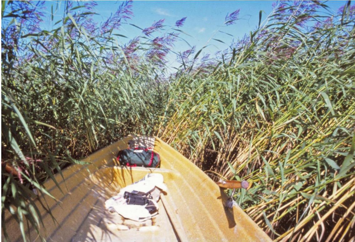
Figure 4. The stands of helophytic macrophytes are impenetrable. The common reed Phragmites australis is the dominant species in the proximal and middle sections of the Kokemäenjoki River delta.

The production capacity of Phragmites australis in the Kokemäenjoki River delta is very high, although the annual production of aboveground biomass up to over 5 kg (dry weight) per square meter is only a small-scale curiosity [36].