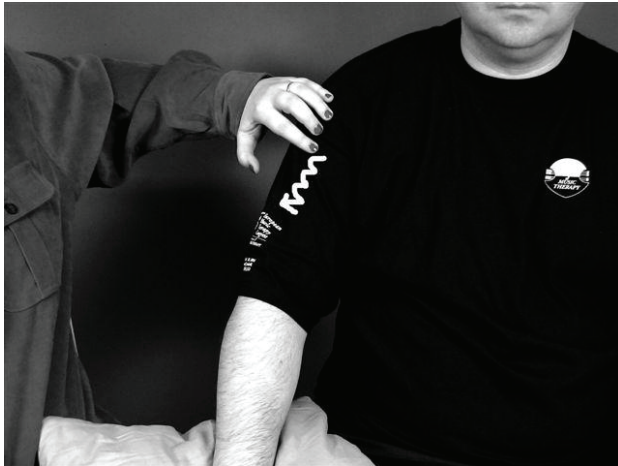
Fig. 1. Musical haptics when sitting side by side (Reprinted with permission from Lahtinen & Palmer, 2005)