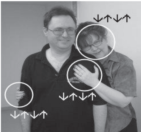
Fig. 3. Using haptics to describe the way the soloist is being thanked on stage

always described before the concert programme starts. These are: the position of the seat with regards to the stage, the orchestra, places of different instruments, number of instruments, and what selection of musical haptics will be used in this particular concert. These methods will enable the user to have a more realistic view of where and what there is in a performance. The different instruments within the score can be defined using Deafblind Manual Alphabet or writing block letters on the palm. A body map of the orchestra can be drawn on the back, so that later in the concert the leading melodies can be pointed at the map on the back. It also helps the person to orientate for example towards the soloists.