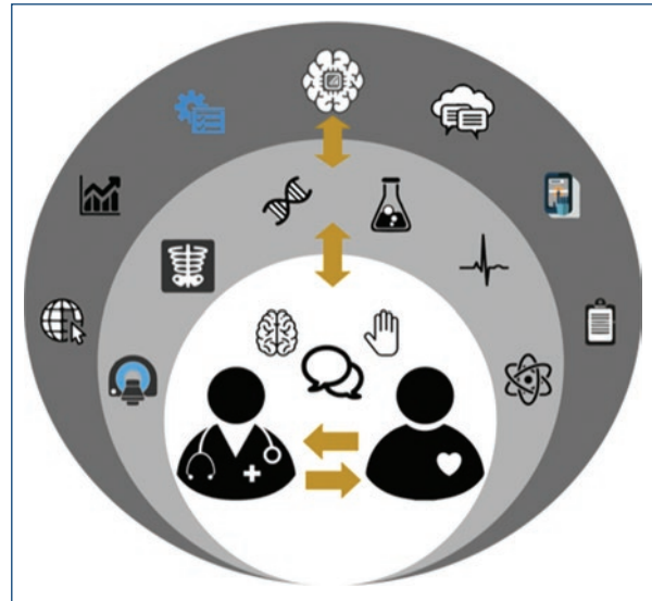
Figure 1. Evolution of the medical paradigm. Representation of the elements present in medicine for establishing an adequate interpersonal relationship, diagnosis, and prognosis. The concentric areas (white, light gray, and dark gray) contain the respective icons of traditional (interrogation, physical examination, and clinical reasoning), para-clinical (laboratory, imaging, molecular, and genetic studies), and digital components (electronic patient records, internet of things, biosensors, big data, artificial intelligence, apps, social networks, etc.) that are brought together in modern medicine. The arrows indicate the flow of information.

New medicine includes not only the information contained in electronic patient records or obtained through advanced clinical studies but also data extracted from various less traditional but considerably wider sources, including the internet of things, “big data,” biosensors (such as watches and sport sensors and smartphones), and specialized devices (such as heart rate monitors, implantable pacemakers, and interstitial glucose monitors; Fig. 1). In 2020, the data generated by these different sources will reach more than 400 zettabytes 2