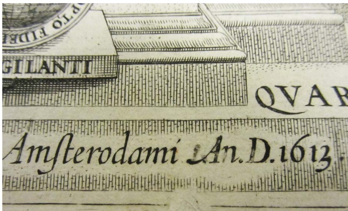
Figure 1. The altered imprint on the title page of the Turku copy of the 1613 atlas.

when the atlas was published (van der Krogt 1997: 80; STCN 118721313 and 112043402). However, as noted above, Jodocus Junior was legally underage and thus too young to be responsible for the edition himself.