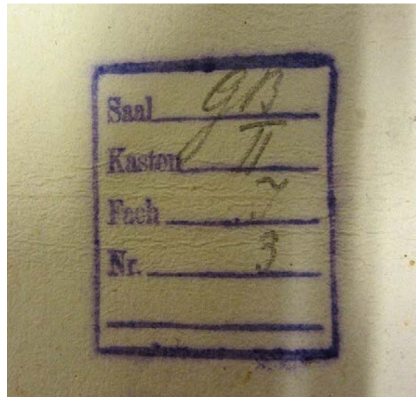
Figure 5. The stamp on the first flyleaf of the Turku copy.

What is certain is that the Turku copy did indeed end up in what is now the Czech Republic: the bookplate of a Moravian nobleman, Egbert von Belcredi (1816–1894), is glued within the front cover. The latter part of his name has been scraped out by a