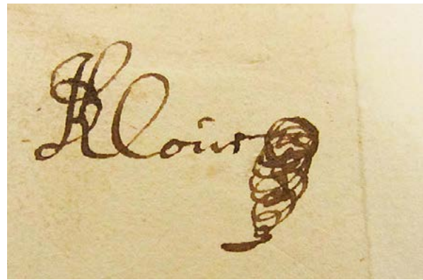
Figure 3. The ownership inscription on the second flyleaf of the Turku copy.

The second flyleaf of the atlas has two ownership inscriptions. The first one, on the recto side, is shown in Figure 3. We tentatively read this as 'D. Klous'. This Dutch surname, albeit rare, still exists. The Database of Surnames in the Netherlands records 213 people with this surname in 2007; interestingly, most of them live in the area of northern Holland that is heavily annotated by the owner of the atlas (see below). On paleographical grounds, we assume this owner to be the earliest one of those whose names appear in the copy. We have not been able to find more information on this owner, which is unfortunate, as Klous may be responsible for many of the notes and corrections discussed below.