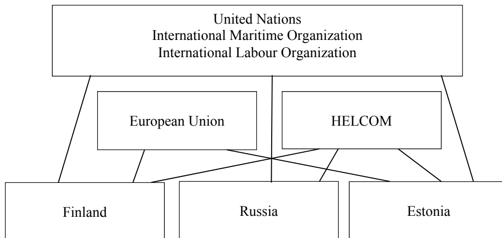
Figure 2.3. Nested hierarchy of the main regulatory bodies of maritime safety in the Gulf of Finland (Kuronen and Tapaninen 2009: 22).

The existing regulatory system is designed to act as a so-called nested hierarchy where the international regulation is the highest level and the lower levels should always be consistent with the higher ones (figure 2.3.) (Kuronen and Tapaninen 2009: 22).