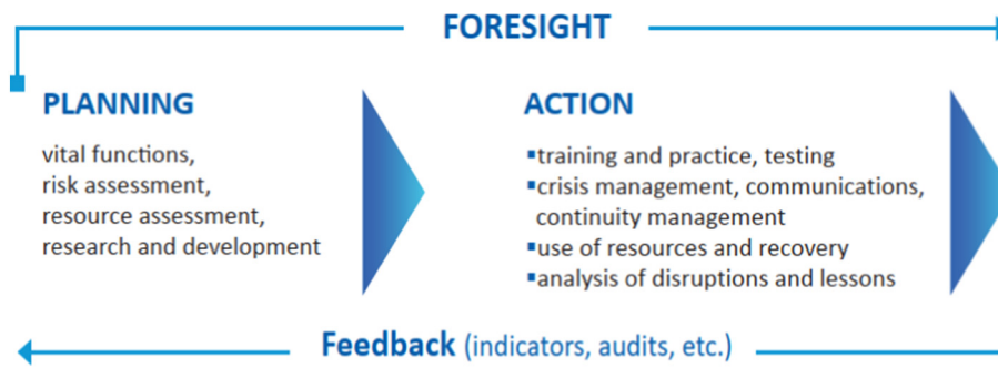
Fig. 1. The preparedness process (The Security Committee, 2017, p. 9).

order' approach to anticipation (Hodgson, 2017; Miller, 2007). Some anticipatory assumptions are specific to a phenomenon under study, such as data protection, and can be articulated for instance through conceptual metaphors for that phenomenon (Inayatullah, 1998). However, recent accounts of anticipation have suggested more generic types of assumptions and orientations towards the future that apply across different phenomena (Anderson, 2010; Miller, 2011; Miller et al., 2018).