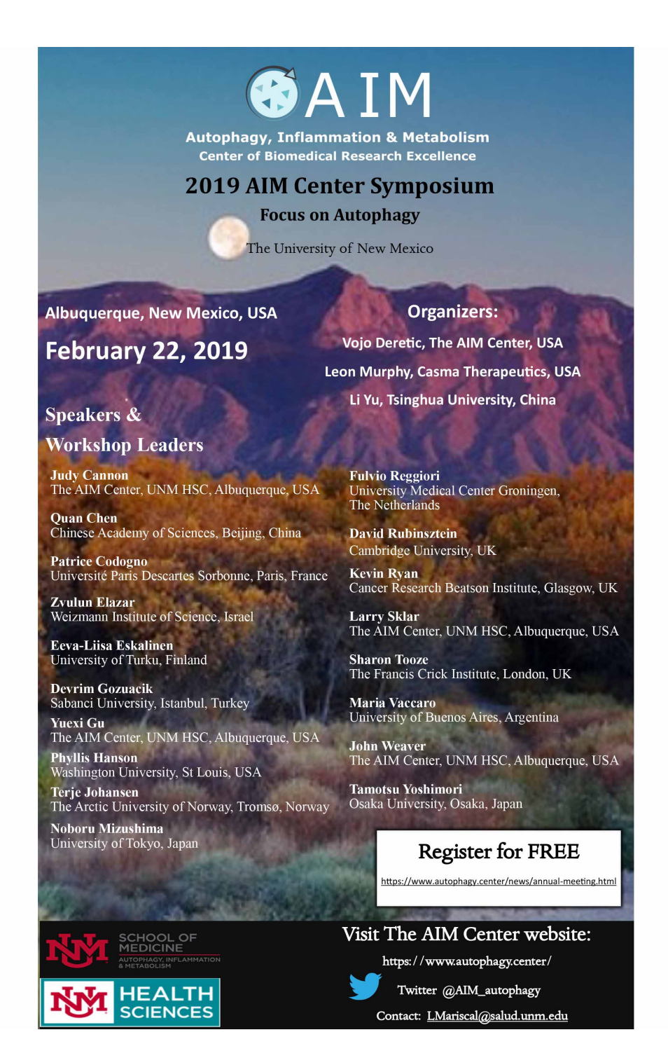
Figure 2. The 2019 AIM symposium scientific program and poster.