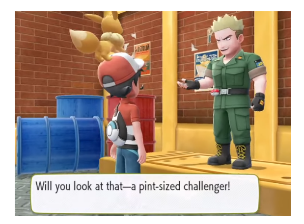
Figure 3. The player challenging the Vermillion city gym leader Lt. Surge.

The level of interaction with others in-game characters or NPCs remains superficial, but especially the later games from X/Y onward have started to display the main character to have a group of friends whom the player frequently interacts with. In both Pokémon games and the anime, helping others is a key motivator. Altruistic behaviour is displayed from behalf of the main characters, NPCs, and even the supposed villains. This almost complete lack of social conflict can make players feel more at peace and accepted.