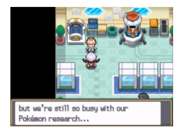
Figure 4. The player converses with the Pokémon professor Elm in his lab.

around the world. While these are the main methods the players move with, other forms of transportation are featured in games. In Silver/Gold the player takes a boat ride on a large cruise ship and later uses a magnet train. In Ruby/Sapphire the player ascends a mountain using a cable car. The games also feature a space center that displays a rocket resembling the Russian Soyuz-TM model. Furthermore, the Pokémon games feature more sophisticated transportation methods such as a teleportation system (in Silph. co. building and Saffron city gym in Red/Blue). What is common in all these transportation methods is that they are never displayed to be polluting, and are rather depicted as green alternatives. Furthermore, moving with a vehicle is only a secondary option that is done occasionally, and in both the games and the animated series, the characters most often move by walking. The emphasis on walking and adventuring is arguably one of the reasons why Pokémon GO works so well as a physical activity increasing exergame [24].