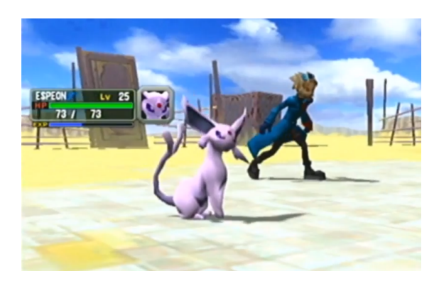
Figure 1. Typical visual feedback of a Pokémon battle. Screenshot taken from the game Pokémon Colosseum by the authors.

Perhaps contradictory to these themes of partnership with nature, biophilia and natural harmony stands capturing pokémon and pokémon battles. Pokémon battles are central in the pokémon series and are the primary way to resolve conflicts. Figure 1 depicts how the trainer is often visualized in Pokémon games to be on the immediate background of the pokémon battle. The same applies in Pokémon movies and the anime. As such, pokémon battles are depicted as fights between humans that use pokémon as a proxy. This draws parallels to sports and board games such as chess where humans engage in conflict through a playful set of agreed rules. Pokémon franchise products seem to stress on multiple occasions that pokémon do not mind battling, and that it is in fact natural and they even enjoy it (e.g. Sun & Moon anime series, ep. 15). In the Pokémon Indigo League anime, the main protagonist Ash Ketchum is shown on multiple occasions to even take hits for his main partner pokémon Pikachu, and only battling with Pikachu on the pokémon's terms. The narrative of the Pokémon world highlights that pokémon are not to be used as tools for battle, or to be captured and enslaved, but instead, seen as partners. This mirrors, for example, horse owners who have been reported to strive for a partnership with their steeds [19].