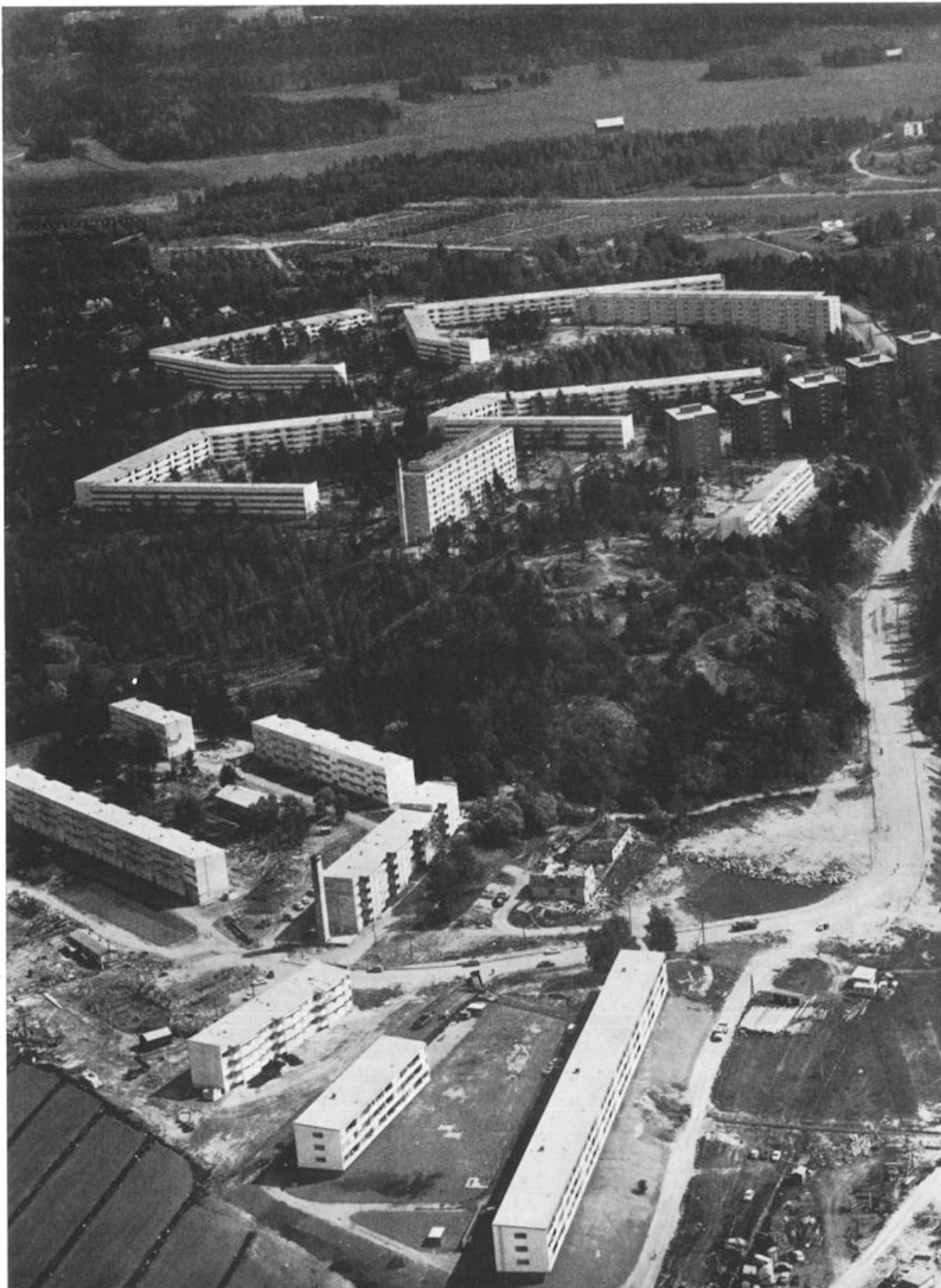
Fig. 5.2 Cover of the Finnish Architectural Review 10–11/1964 illustrating Pihlajamäki estate. Source Finnish Architectural review, used with permission