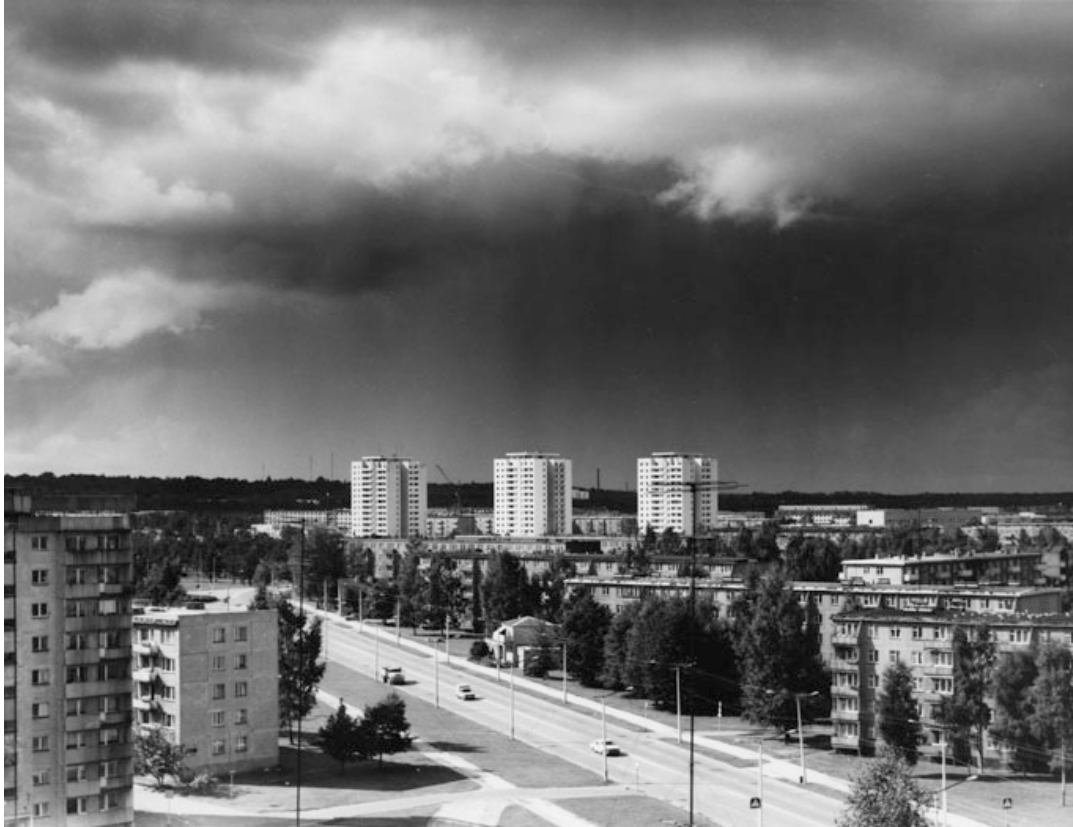
Fig. 5.5 The first mikrorayons of Mustamäe estate in Tallinn (1958–73) consist of 4- to 5-floor apartment blocks built with 1-464 standard.