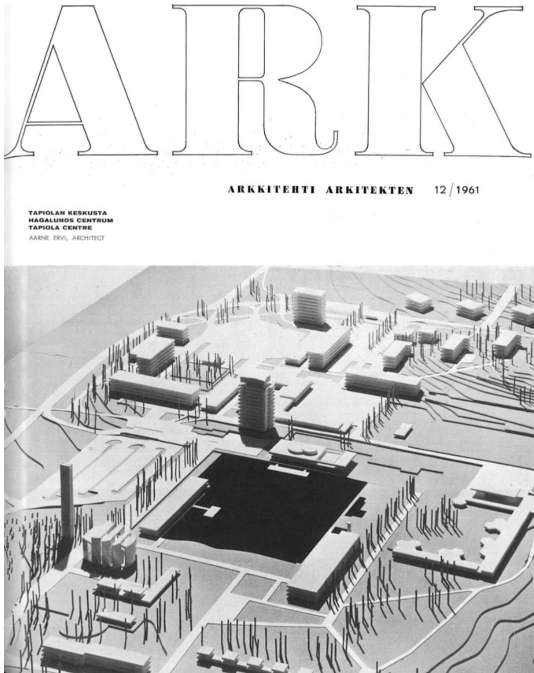
Fig. 5.1 Cover of the Finnish Architectural Review 12/1961 illustrating Tapiola Centre by Aarne Ervi. Source Finnish Architectural Review, used with permission

4-storey buildings following the landscape, and tall tower blocks located on the highest point of the hill. The commercial services are mainly located in the area's own shopping centre (Hurme 1991, 144–163).