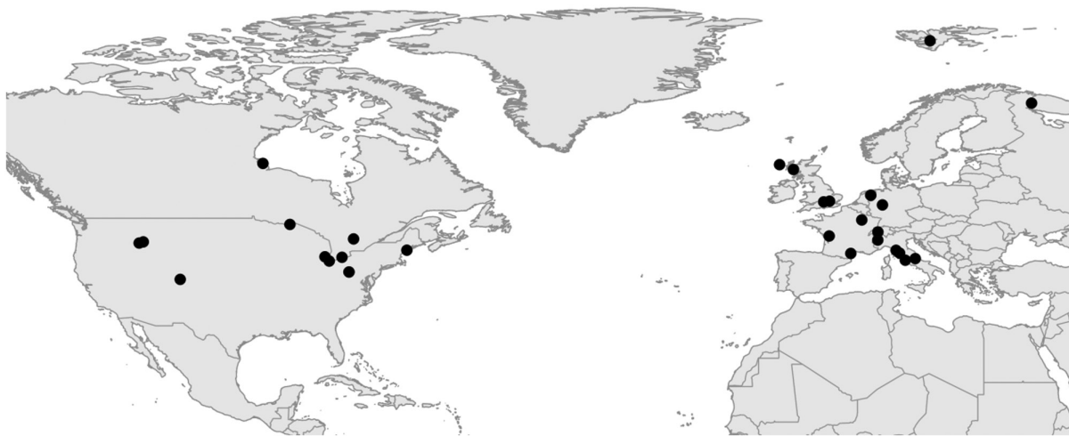
Figure 1. Locations of the 59 study populations included in the dataset. Note that each location may contain multiple populations.

For each study location, we extracted monthly gridded values of two key climate variables – temperature ( ^{\circ}\text{C} ) and precipitation ( \text{mm month}^{-1} ) – at a high spatial resolution ( \sim 4 \text{ km} , 1/24^{\circ} ) from the TerraClimate dataset (Abatzoglou et al. 2018). Both of these climate variables have been found to affect population dynamics of most of the organismal groups considered here (Post and Stenseth 1999, Deguines et al. 2017, Mills et al. 2017) and therefore, we chose to use the same climate variables for all organismal groups. From these climate data, we derived values for the six-month average of temperature and precipitation for the periods April–September and October–March. In the Northern Hemisphere, these two periods correspond to the active growing season (spring–summer) and the non-active season (fall–winter), respectively, with each period reflecting different environmental conditions. Although less-studied than climatic conditions during the active growing season, changes in winter climatic conditions can also influence the survival, overwintering success and performance of individuals during the following growing season, which can ultimately affect the population growth rate and its variability (Roland and Matter 2013, Williams et al. 2015).