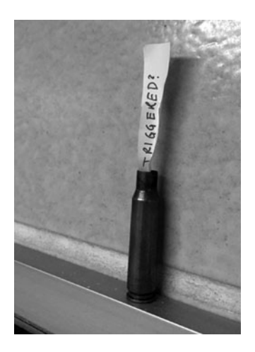
Figure 4. "Triggered?" UT Austin.

inside which was stuffed a tiny scrap of paper with a single word: "TRIGGERED?"29 (see Figure 4).