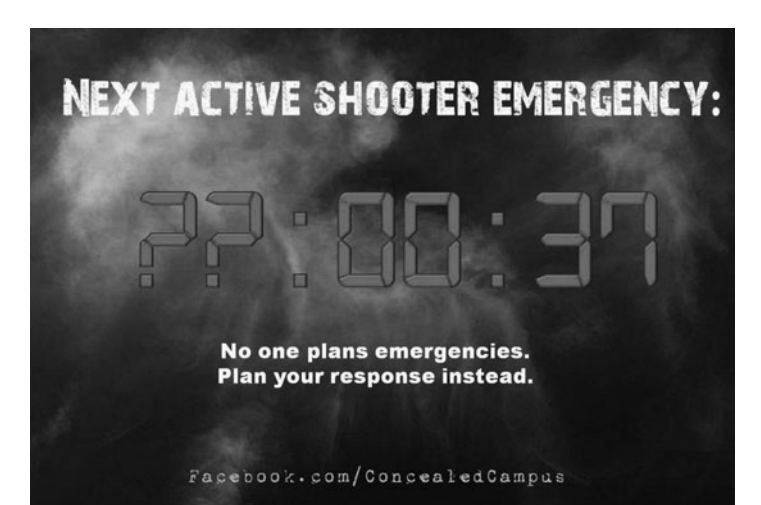
Figure 1. http://concealedcampus.org/images-slider/axiom-oo8.jpg (accessed 5 May 2019). Use permission granted by Students for Concealed Carry.

Nor should one necessarily correlate the logic of preparedness with fear. As focus shifted after the Cold War from the material world of bomb shelters to the human sphere of behavior, people are expected to be hardened, not sensitive, to shooter events.<sup>20</sup> Furthermore, while it could be argued that preparedness reflects a growing societal sense of ontological insecurity,<sup>21</sup> whatever the current bogeyman may be, gun rights groups fundamentally reject the connection between fear and security.