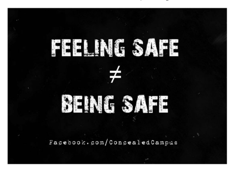
Figure 2.

says this much more simply: "Feeling safe or unsafe is not the same as being safe or unsafe."23 And their meme boils it down even further (see Figure 2).