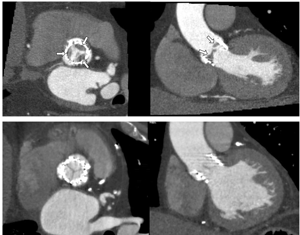
Fig. 1 Multiplanar reconstructions of transcatheter aortic valves on multidetector row computed tomography with HALT (white arrows, upper panel) and without HALT (lower panel)