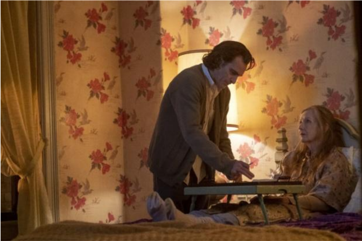
Image 6. Joaquin Phoenix and Frances Conroy in Joker .