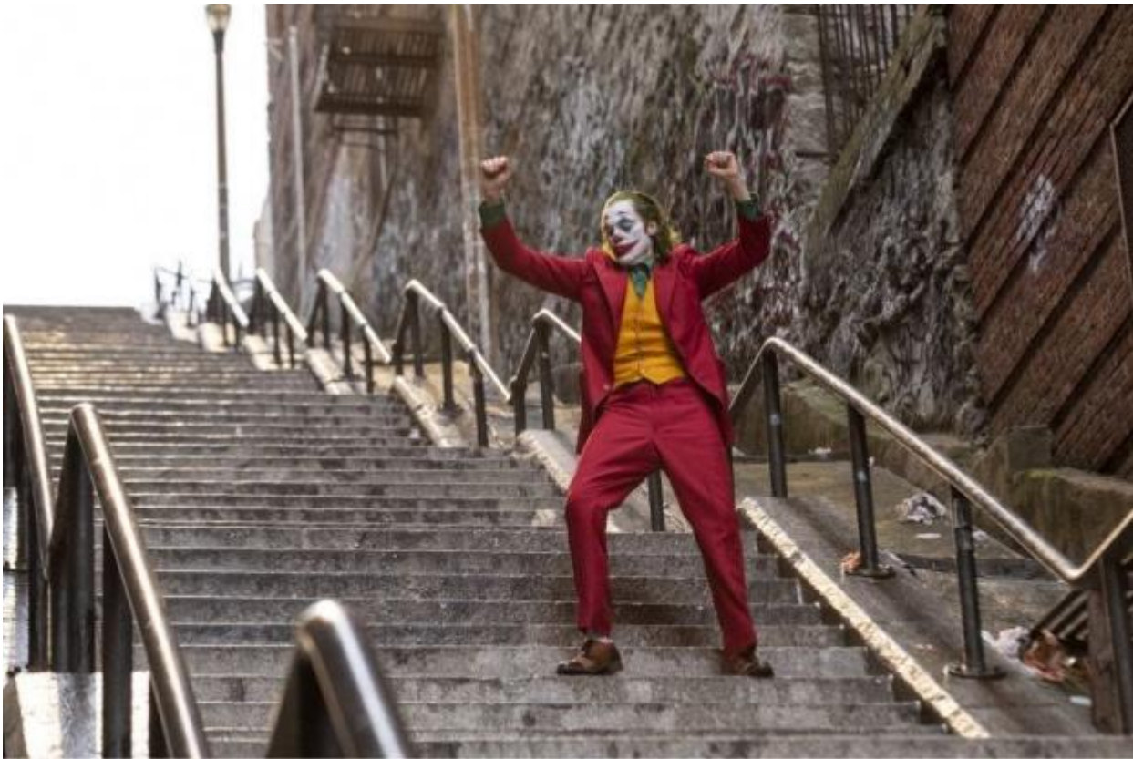
Image 4. Joker dances down the stairs.

uses his body while dancing and how he walks—resembles that of other cinematic male figures with sex appeal. A cigarette hanging between his lips complements his erotic image.