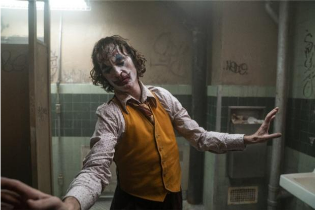
Image 2. The Bathroom dance. Joaquin Phoenix in Joker

After the subway killings, it is as if he has sexually awakened. AF is not an asexual person per se; in the movie, his sexuality prior to the subway killings appears to involve pornographic images, but his sexuality is not expressed in his body language. According to the original script, he is sexually inexperienced. After his dance in the public bathroom, however, it seems that he has become sexually aroused. Immediately thereafter, the camera follows him down the corridor of the apartment building where he lives; he heads determinedly, in a straight line, toward Sophie's door. When she opens it, he immediately kisses and embraces her, and the slow motion suggests that they are about to have a sexual encounter. As revealed by the filmmakers ( Flicks and the City 2019), AF's relationship with Sophie is just a dream, [2] but Arthur the clown is nonetheless eroticized for the first time: he expresses sexual desire (even if in his own mind), and his sexuality is now expressed in his body and in his movements. It is no longer made manifest merely in the pornographic images of his journal, which suggest a boyish and inexperienced type of sexuality.