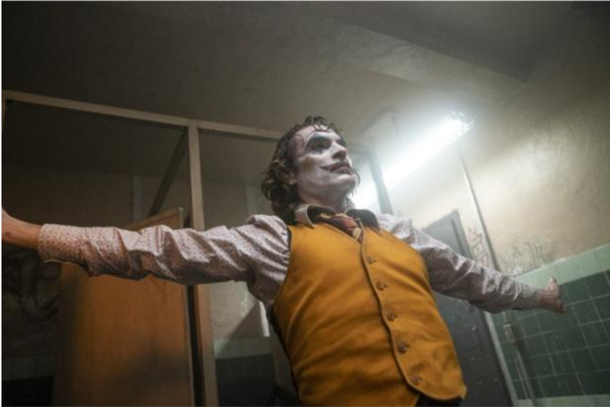
Image 3. The Bathroom dance. Joaquin Phoenix in Joker ( Joker © Warner Bros. 2019)