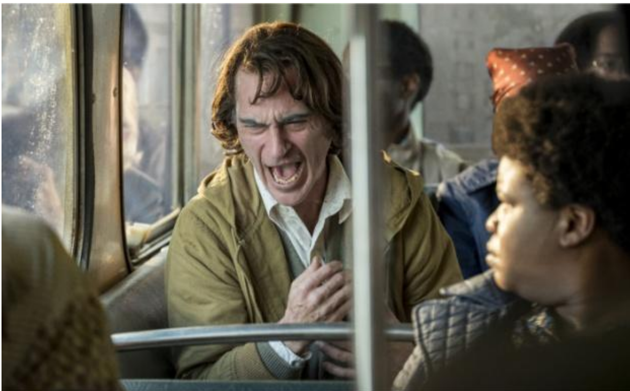
Image 1. AF’s pathological laughter. Joaquin Phoenix in Joker.

As a child who was always “happy,” perhaps he laughed instead of crying, as seen above. AF’s laughter, therefore, is a gesture that underlines his detachment from his social environment. Laughing sometimes signifies his desperate attempt to be “normal,” but in general AF’s laughter is difficult to interpret in a conventional way. He appears to laugh uncontrollably when he is confused, nervous, anxious, sad or upset; when he is hurt; when he thinks he has been unjustly treated; or when he hears things he does not want to hear, like when Mr. Wayne implies that AF’s mother’s story about him being AF’s father is false. Even stage fright appears to trigger his uncontrolled laughter. Moreover, this laughter is constantly misinterpreted, being read differently by others.