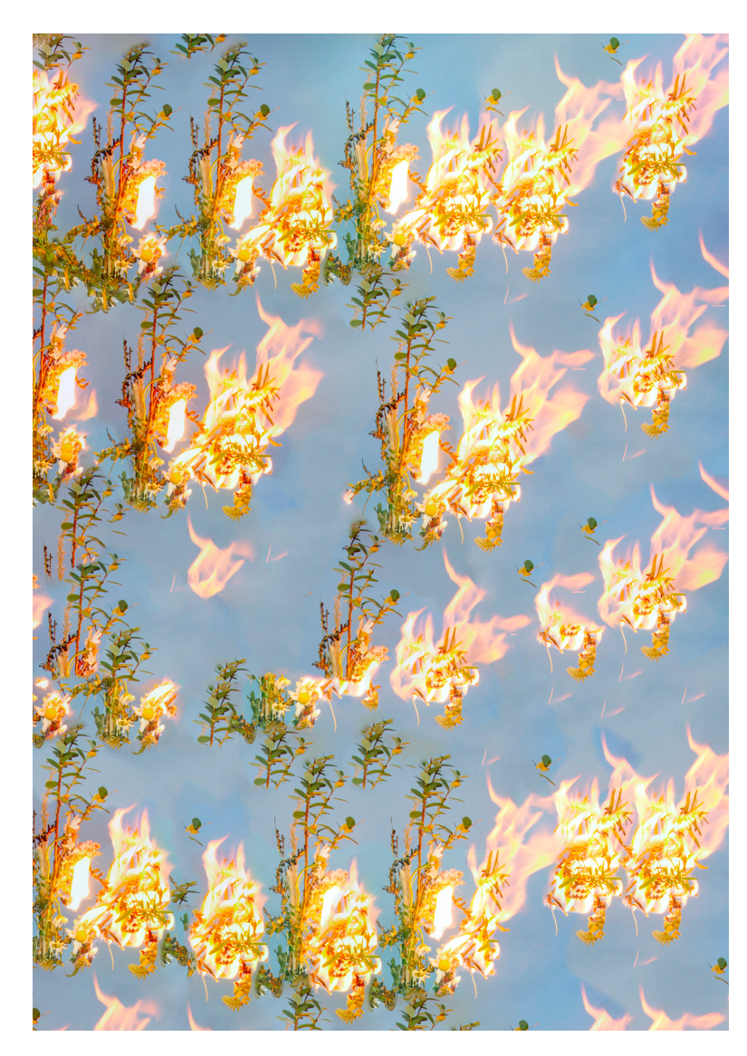
Figure 3. Liina Aalto-Setälä, From the series Landscapes , 2015- .