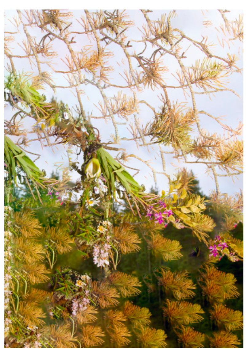
Figure 4. Liina Aalto-Setälä, From the series Landscapes , 2015- .