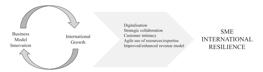
Figure 2. Construction of SME international resilience.

Transforming an SME into an international data-based service business requires substantial and highly interrelated changes; thus, simple incremental adaptations to the current business model are not a viable option. Instead, the case companies have recognized a transition period of a few years during which the firm needs to run two business models in parallel. The firm may either gradually give up the old business model or separate the two business models into different companies. Notably, this transition period is a challenging time for SMEs that have limited resources. Therefore, it is possible that the international growth of these companies will have features of 'resource scavenging'; a phenomenon, which has been previously identified among internationalizing high-tech companies (Hewerdine et al., 2014).