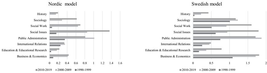
Figure 1.2 Share of articles using the Nordic and Swedish models as concepts in certain research areas from 1990 to 2019 (per mil from all articles in different time cohorts).