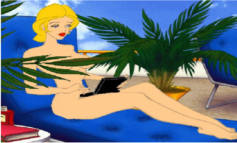
FIGURE 2. Drew Baringmore and the pesky branch. Larry 7: Love for Sail! (Sierra Entertainment, 1996). [Color figure can be viewed at wileyonlinelibrary.com ]

lineage, exploring conversation options by directly asking for sex in any Larry often results in scorn being heaped upon him and his over-reaching aspirations. The fiction puzzle design, however, allows for and anticipates such experimentation, as ludic errors usually reward the player with comic drama and/or successful progression.