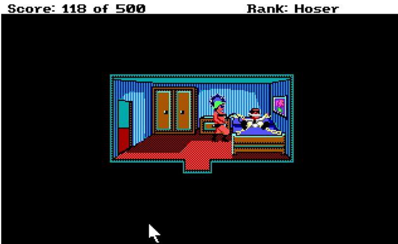
FIGURE 3. Larry and Barbie's mother; a "game over," that is. Leisure Suit Larry Goes Looking for Love (in Several Wrong Places) (Sierra Entertainment, 1988). [Color figure can be viewed at wileyonlinelibrary.com ]

second-person address along with the protagonist. This, nevertheless, is not clear-cut; and of course, players always watch Larry's painful humiliations and frequent violent deaths from a safe distance, perhaps with a touch of schadenfreude . Still, along with progress, it is the player's past errors that turn into a gradual epiphany of control: as puzzles get solved, Larry and his partners get demystified and exposed—a distinct superiority comes into being through the ludic-comic, disarming Larry's "deaths" of their initial danger and turning them into something to laugh at.