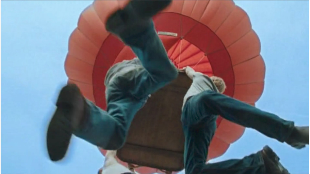
Picture 1: The Balloon Music is first heard when the hot air balloon rises into the sky. © Paramount Classics & Pathé Pictures

Musically, the “Balloon Music” is an allusion to Ralph Vaughan Williams’s (1872–1958) orchestral work The Lark Ascending (1914), inspired by a poem of the same title by George Meredith. The allusion is also thematically interesting. In The Lark Ascending , the solo violin depicts the lark, a symbol of the human spirit, soaring up into the heavens. In the “Balloon Music”, the solo violin also depicts the human spirit rising to the heights, only this time to be thrown back into the depths, which will be heard later in the film in dark variations on the leitmotif (see Table 1). The allusion to the pastoral character of The Lark Ascending may also suggest the experience of the sublime, an overwhelming experience of something beyond our understanding.