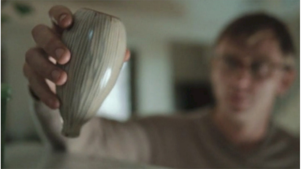
Picture 2: Joe is obsessed with the traumatic image of the hot air balloon.

Like a Strange Balloon Mounts Towards Infinity , 1882), portrays an all-seeing and stalking eye gliding over an empty field. A floating object in the sky “sees everything” from above.