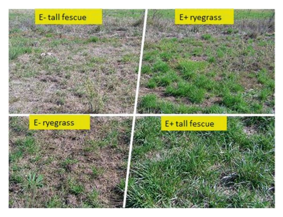
Fig. 6.4 Perennial ryegrass ( Lolium perenne ) and tall fescue ( Schedonorus arundinaceus ) small plots in autumn near Bega, New South Wales, Australia (4 years post sowing). Differences in persistence predominately due to damage from African black beetle ( Heteronychus arator )

recorded in other regions of New Zealand, with the advantage to endophyte varying between regions corresponding closely to the severity of both soil water deficit and insect pest pressure particularly in the summer-autumn period (DE Hume unpublished data).