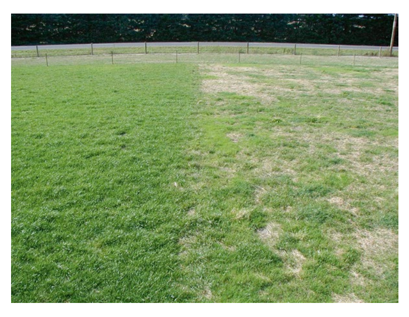
Fig. 6.2 Endophyte-mediated resistance to insect herbivory showing endophyte-infected ( left ) and endophyte-free ( right ) meadow fescue ( Schedonorus pratensis ) plots in early spring at Lincoln, New Zealand. Damage to the endophyte-free plot is due to herbivory of roots by the larvae of grass grub Costelytra zealandica