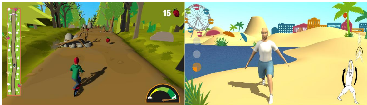
Figure 1. Game A (left) and Game B (right) from the player's point of view.