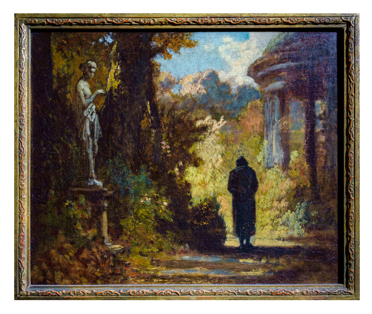
Figure 6. Carl Spitzweg, Der Philosoph im Park , ca. 1860. Oil on canvas, 27,5 x 34 cm. Inv. No. G 0548.

figures of the wanderer with remarkable similarities, both in their depiction and their meditative slow walking, the viewer can notice that based on the composition and the perspective, the distance between beholder and figure provides two different interpretations of the event in the image. In Carus' painting, the monumental figure of the pilgrim, though obscured by the night scene, reveals a few details about his clothing and gear, as well as his being barefoot, but we do not know much about the path that he has walked until now, which thus remains uncertain. Instead, what dominates is the future and the beyond, which correlates perfectly with the idea of the pilgrimage, a wandering to the east where the sun comes, where the son of God finds his origin. For the pilgrim, the future is the experience of an original time. In Spitzweg's painting, the figure seems to be much further away from the beholder and thus its silhouette appears slightly darker and less detailed, even more so because of the contrast with the yellow autumn leaves reflecting the sunlight. Nevertheless, the painting offers a better view of the path traversed thus far, for one can see puddles on the road, which provides an idea about the atmospheric circumstances of the