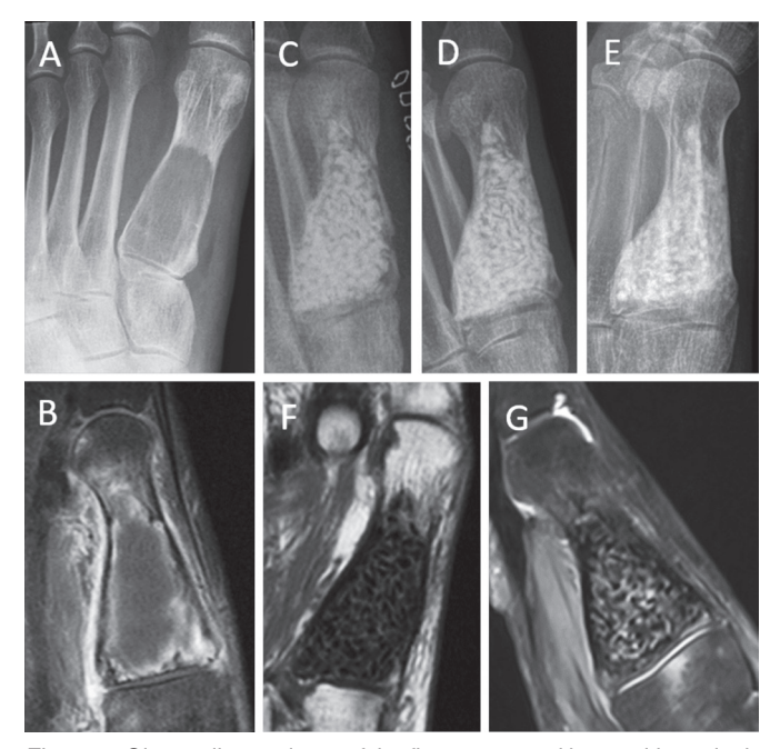
Figure 2. Giant cell granuloma of the first metatarsal bone with corticalbone thinning and an undisplaced pathologic fracture in a 42-year-old female (A-B). Radiographs immediately after tumor evacuation and filling with BG granules (C), at 1 year (D) and at 3 years (E) showed incorporation and gradual changes of BG granules. Postoperative MRI images demonstrated no signs of residuals (T1-weighted sequence) (F) and no tumor recurrence at 1-year (T2-weighted sequence with contrast enhancement) (G).

At 1 year, MR images showed reconstitution of cancellous bone structure in autografted defects, incorporation of allogeneic grafts in large defects, and the healing of cortical bone windows independently of the filling material. MR images were not amenable to the measurement of new bone within narrow spaces between BG granules. BG granules showed low signals of T1, T2 weighted imaging and did not exhibit remarkable dissolution with time.